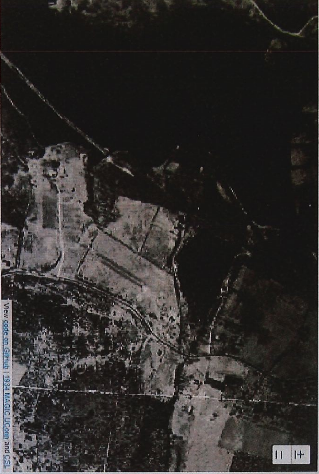
View guide on GitHub | 1934 MAGIC UConn and CSU

Other GIS software users! The 1934 Aerial Photography layer is available via MAGIC's MMS