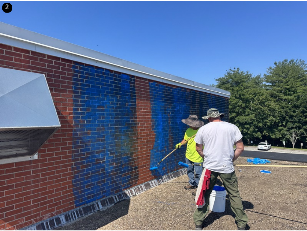
2 Crew applying primer to masonry wall in preparation for ice and water layer