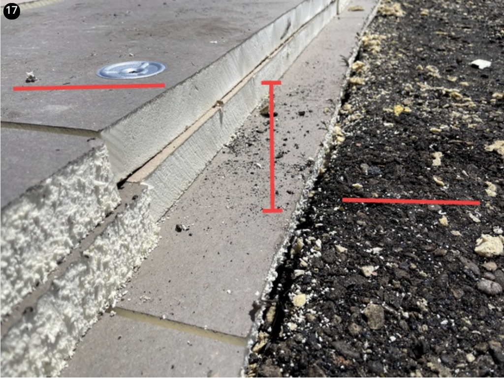
The difference in height between the old roof and the new roof