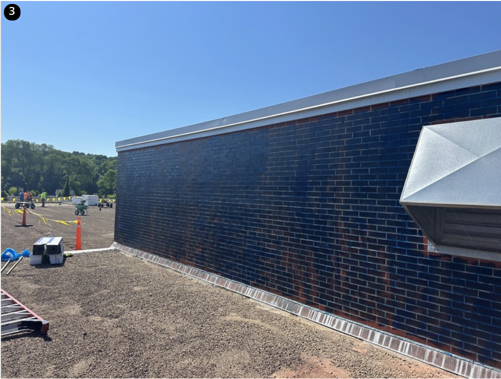
Primed masonry wall