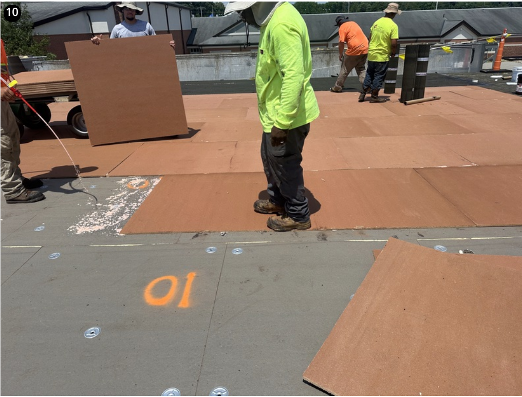
Coverboard being installed in foam adhesive as specified