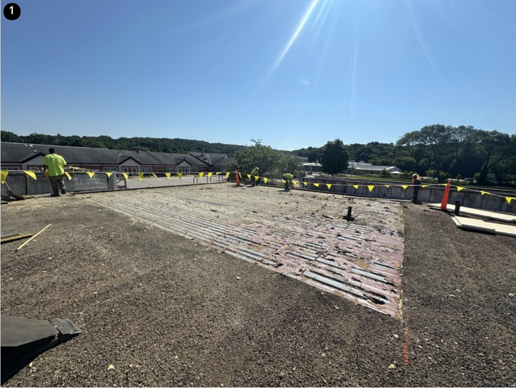
1 First area ripped to metal deck