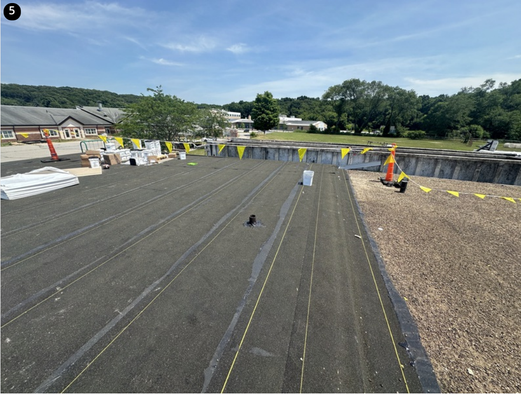
Base sheets installed over insulation and coverboard- Good bleed out at lap seams