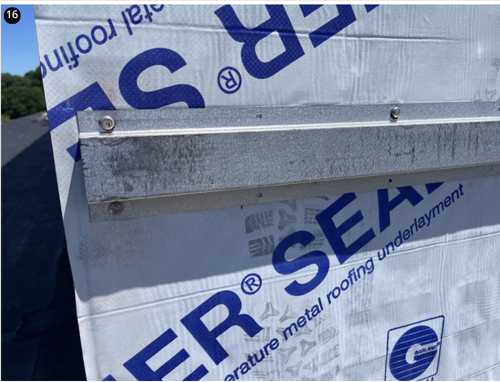
Hat channels for wall panels installed properly