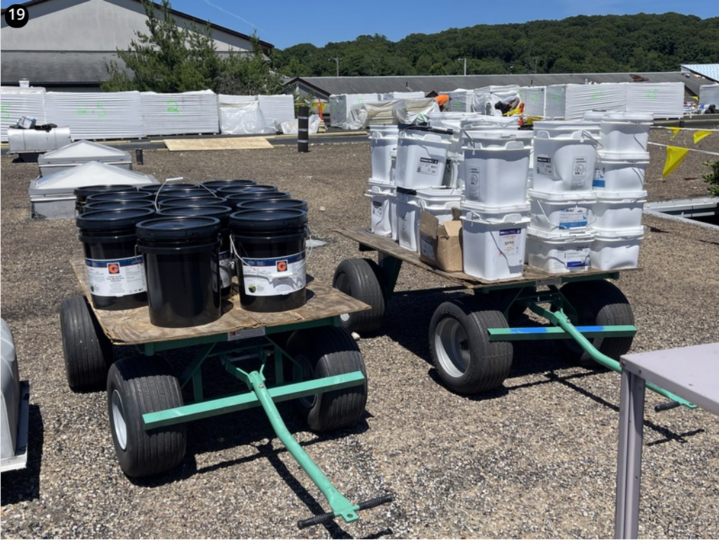
19 Overview - Proper material storage on the roof