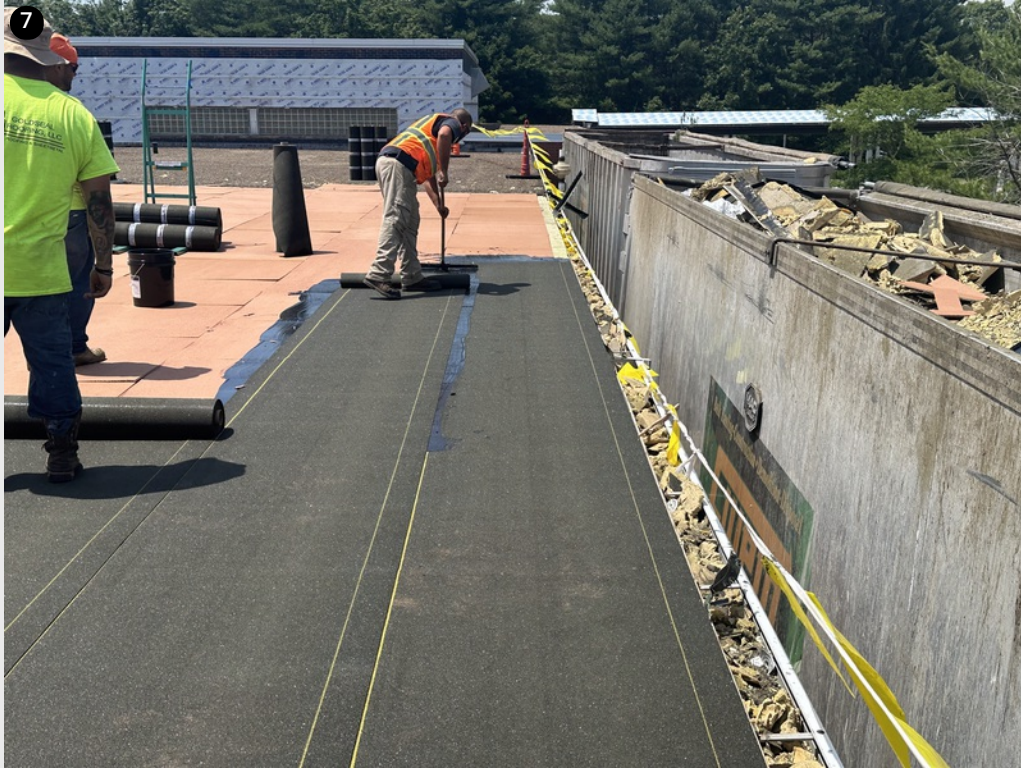
7 Crew rolling base sheets out over insulation and cover board using cold adhesive