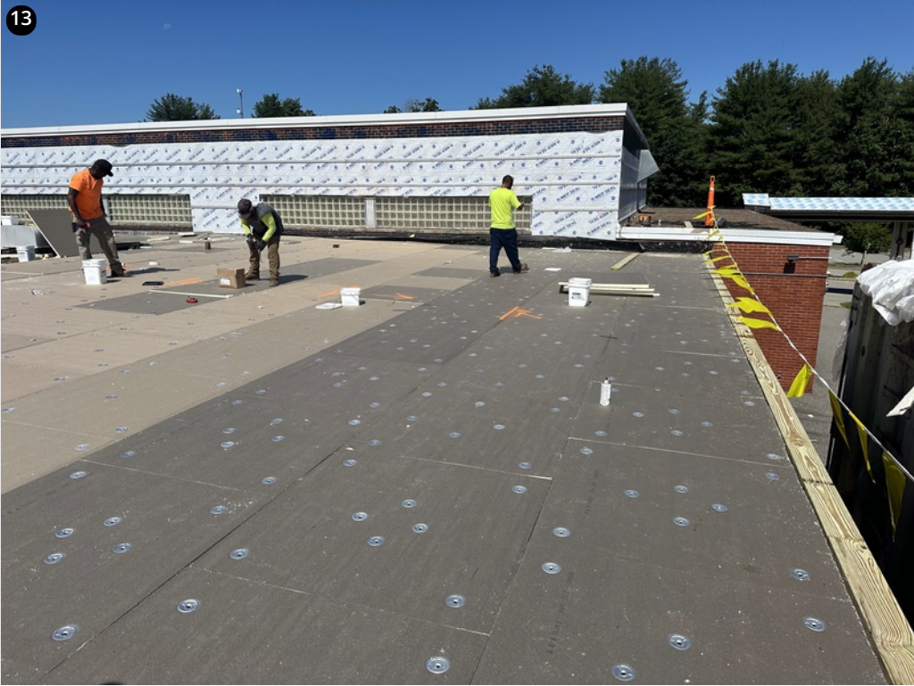
Section closest to the cafeteria - Insulation installed