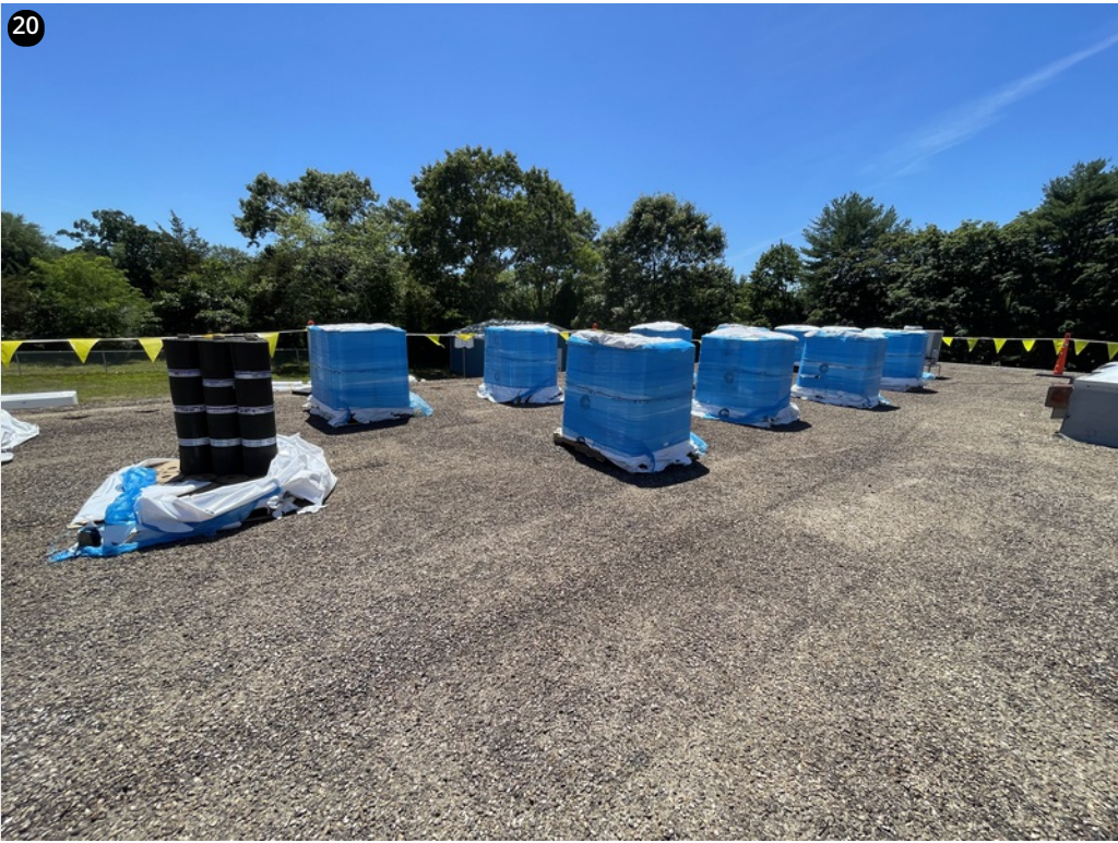
20 Overview - Proper material storage on the roof