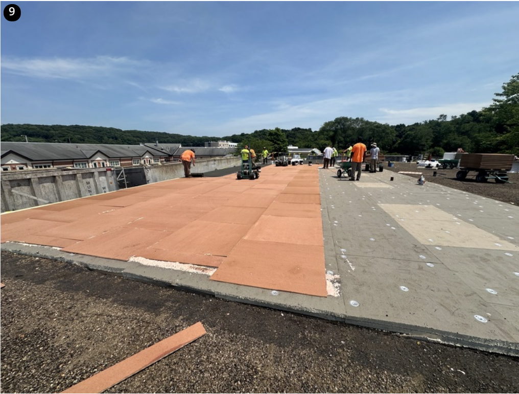
Coverboard being installed over insulation properly