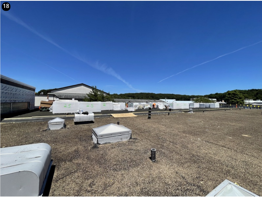
Overview - Proper material storage on the roof