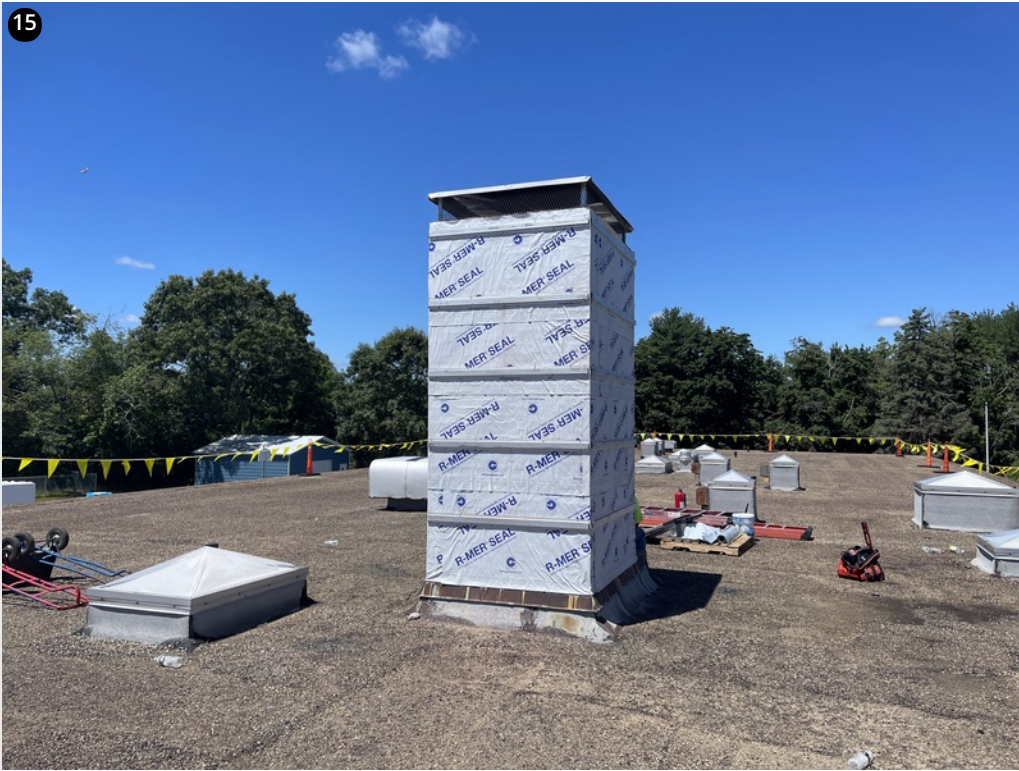
Chimney primed, wrapped and hat channeled