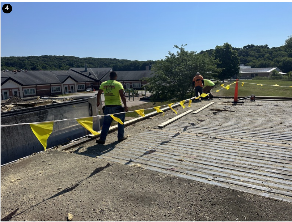
Crew installing pressure treated blocking to accommodate new system layers