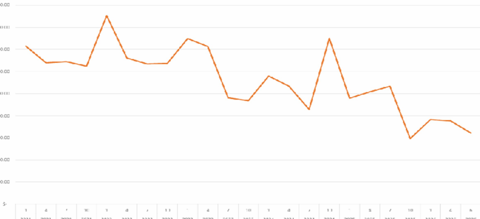
WATER FUND CASH BALANCE FY21 - FY25