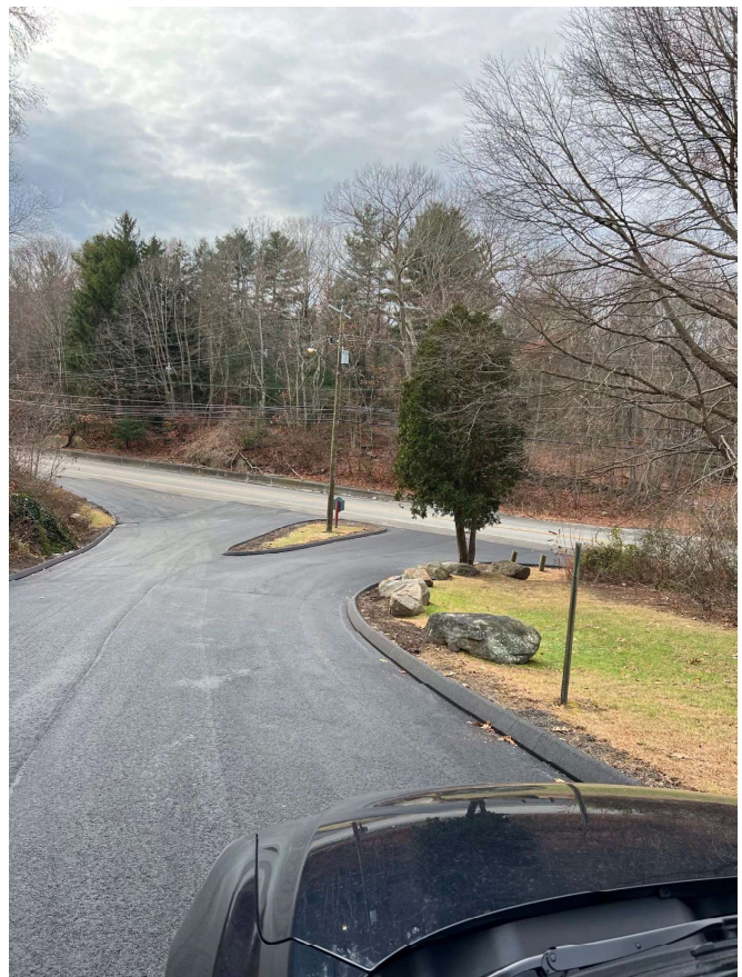
This pic is headed down my hill and across from Mt. Decatur.