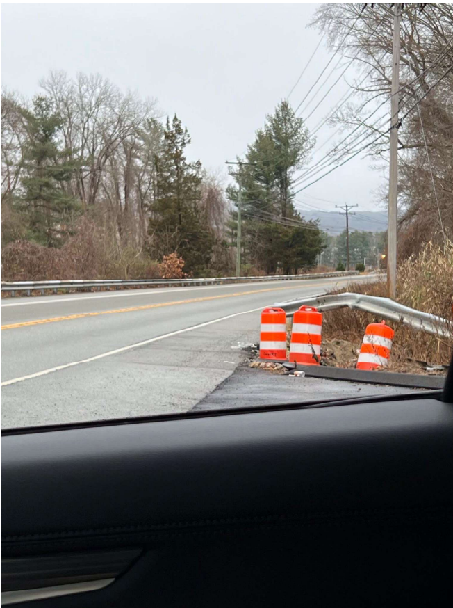
This is a pic below of the bottom of my hill turning right heading to Holmbergs. Excuse the barrels they are there due to an accident happening a couple days after the traffic consultant spoke. And he specifically mentioned "the curve". The road was closed for hours.