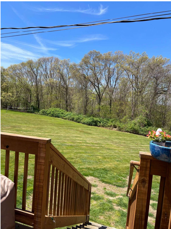
The picture is out my back deck it shows the tree line buffer to rt 12.