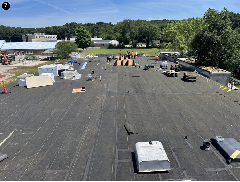
Overview- Crew installing base sheets on final area of playground side