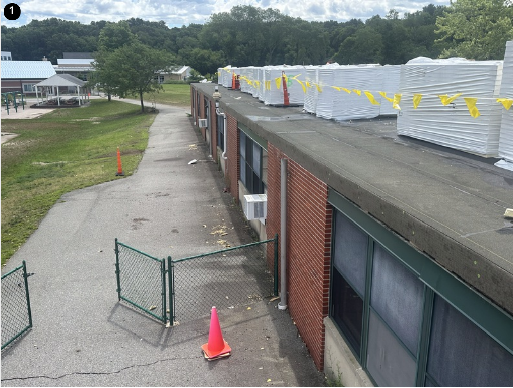
1 Exposed decking detail on perimeter temporarily fixed- No new leaks have been observed