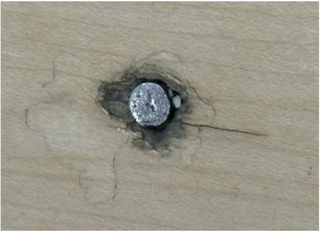
These are but two of the many nails attempting to hold the floor down. The stress lines and cracks in the wood make it obvious that these nails are not the first to be used in these places and are struggling to stay in place. In the second pic, the nail is clearly beginning to protrude