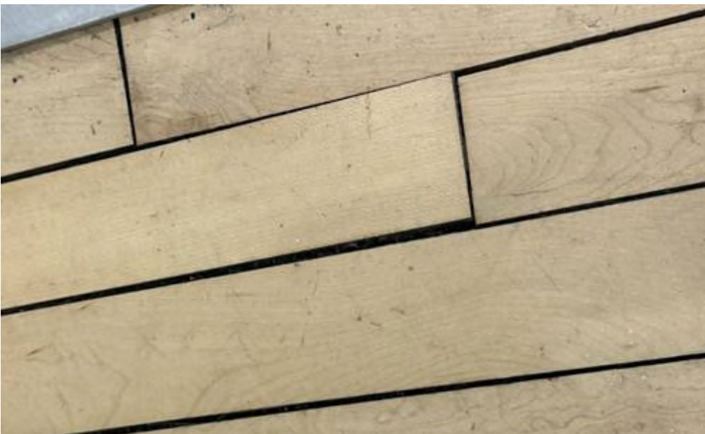
Floor boards separating and even breaking apart.