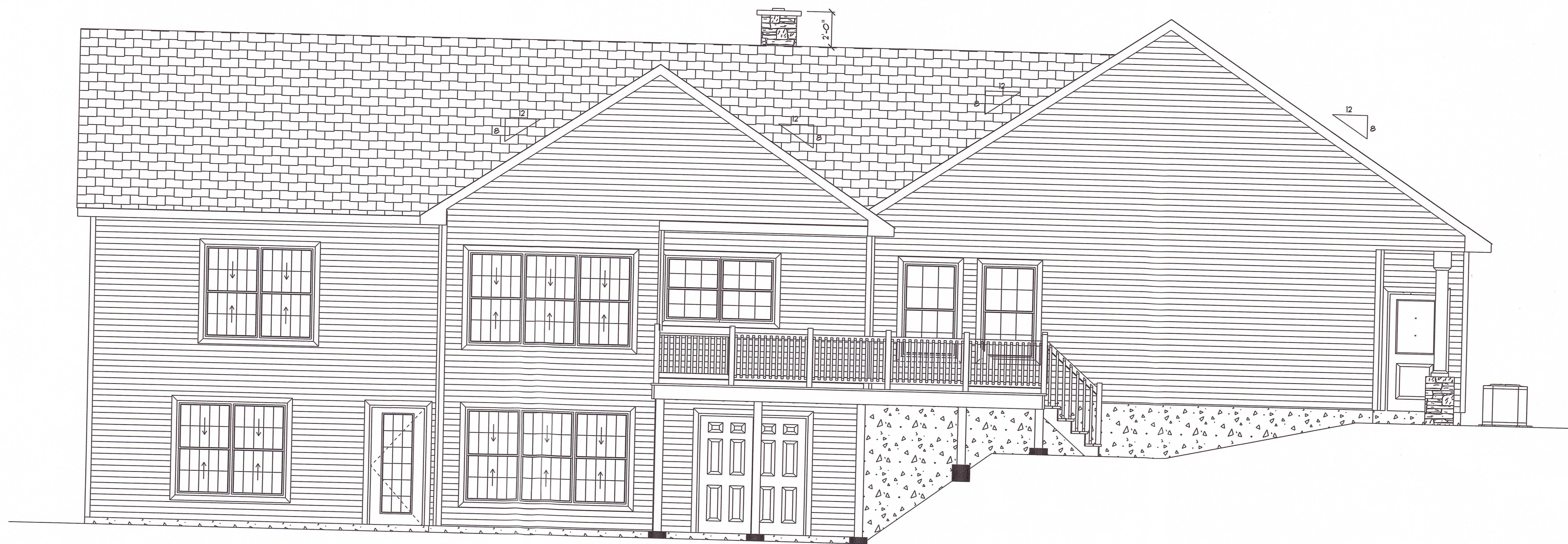
Proposed Rear Elevation View