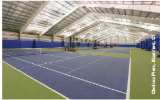
Chelsea Piers, Stamford, CT

Durability • Reliability Playability • Engineered to Last