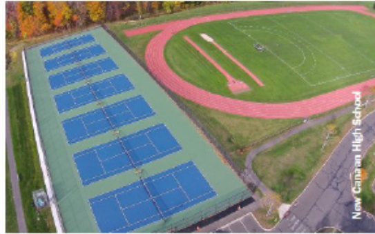
New Canaan High School