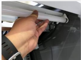
Easy access UVB –UVA fluorescent lighting