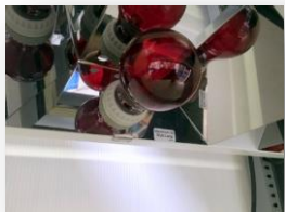
Easy access heat lamps