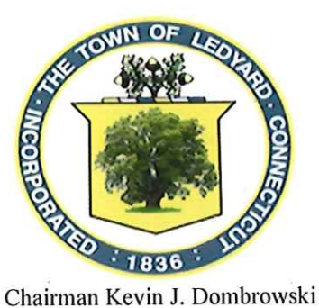
TOWN OF LEDYARD CONNECTICUT

741 Colonel Ledyard Highway Ledyard, Connecticut 06339-1551 (860) 464-3203 towncouncil@ledyardct.org