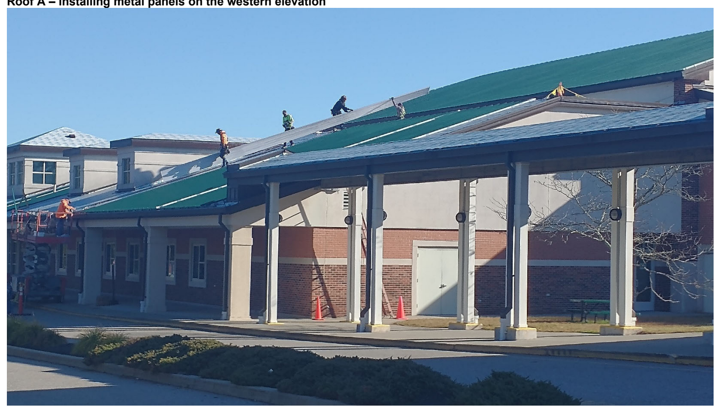
Roof A - North elevation