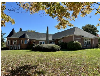
Bill Library 718 Colonel Ledyard Hwy Ledyard, CT 06339 860-464-9912