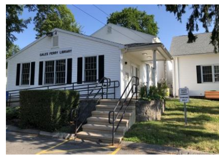
Gales Ferry Library 18 Hurlbutt Road Gales Ferry, CT 06335 860-464-6943

As champions of lifelong learning, libraries are a place to access technology, indulge curiosities, and explore new ideas, hobbies, and careers. At the Ledyard Public Library, our focus is centered around carrying out our mission, achieving our strategic plan goals, and continuing to make the library a welcoming and accessible place for all. We are beyond grateful for our patrons who enjoy library services that are made possible through funding from taxpayer dollars, support groups, and individual donors. All of these generous contributions enrich library services and change lives.