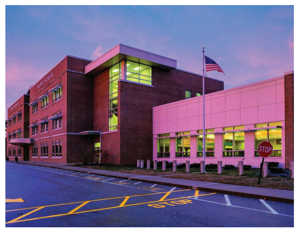
North Smithfield Middle School

Capital resources available to STV include an existing line of credit for working capital. In addition to the term loan, the Company has a $55,000,000 revolving credit facility, with a sublimit of $10,000,000 for standby letters of credit and a sublimit of $15,000,000 for a swing line facility. As of September 30, 2021, there were no borrowings against the line of credit. Outstanding letters of credit as of September 30, 2021 were $1,732,625. We believe that our current operations and borrowing capacity is sufficient to sustain current and future operations. The company has been profitable in past years, excluding fiscal year 2001, which was the result of a one-time cost of restructuring. Without these one-time restructuring costs, our fiscal year 2022 would have been our twenty-ninth consecutive year of profitability. Our backlog continues to remain strong. A copy of our most recent balance sheet and income statement can be provided upon request.