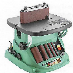
Grizzly Industrial Oscillating Edge Belt and Spindle Sander