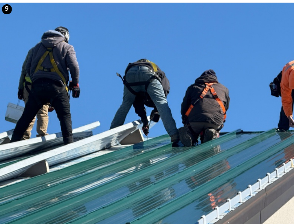
Replacing fasteners with 8" HD's