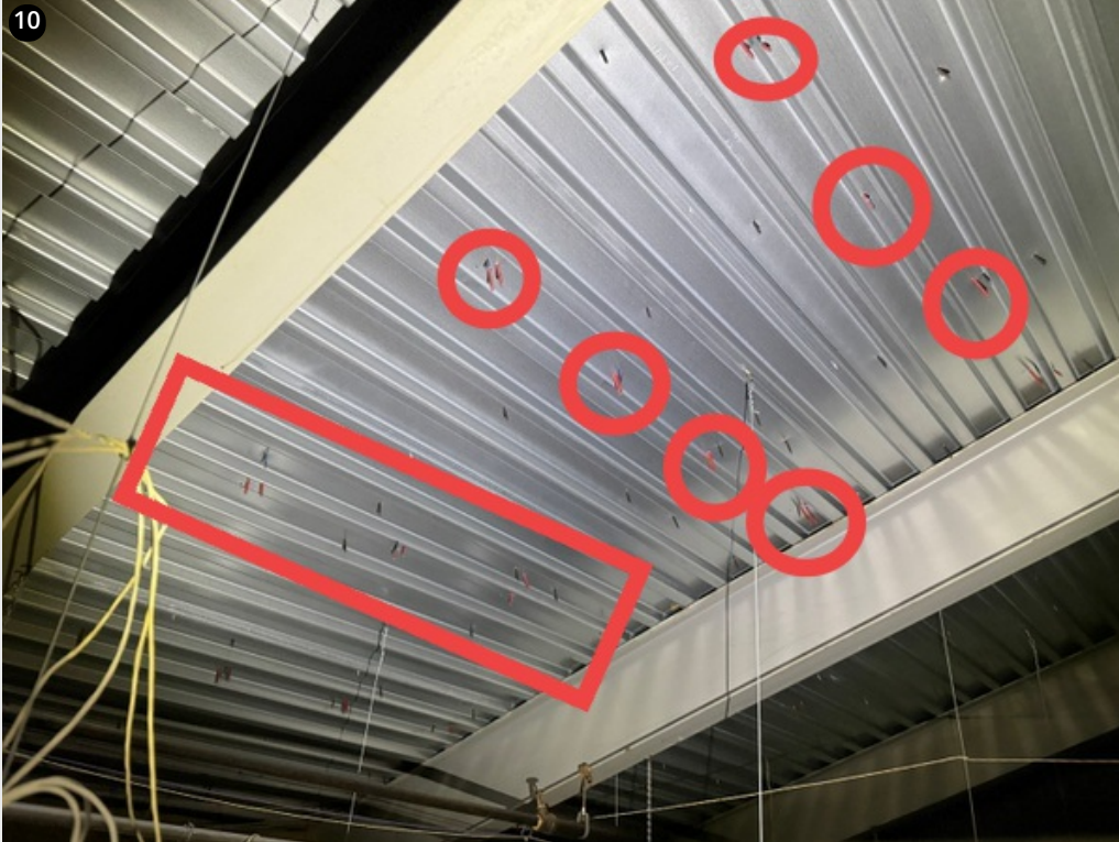
Verification of 8" fasteners and clip spacing