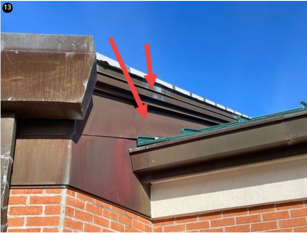
Area of detail question with the SD