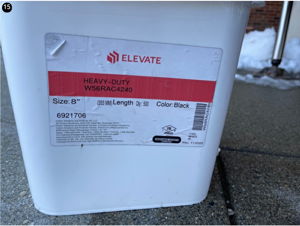
15 Verification of fasteners utilized - 8" HD