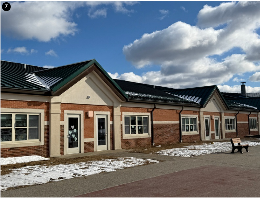
Overview of completed fascia on dormers