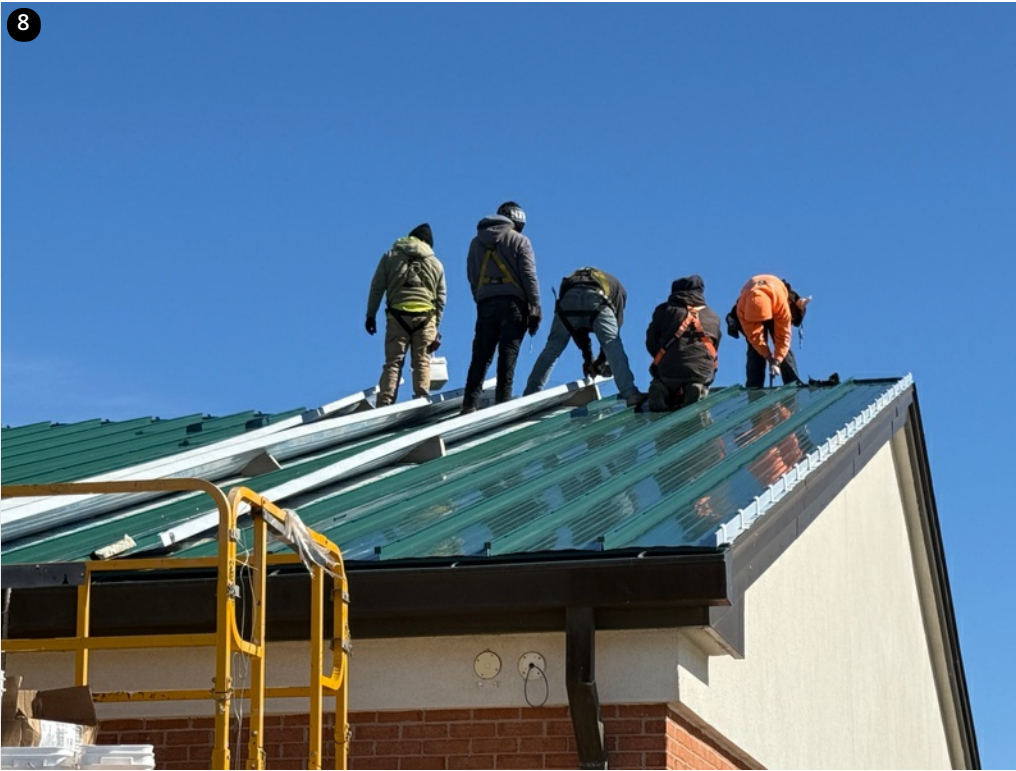
Crew on the back side of the kindergarten wing