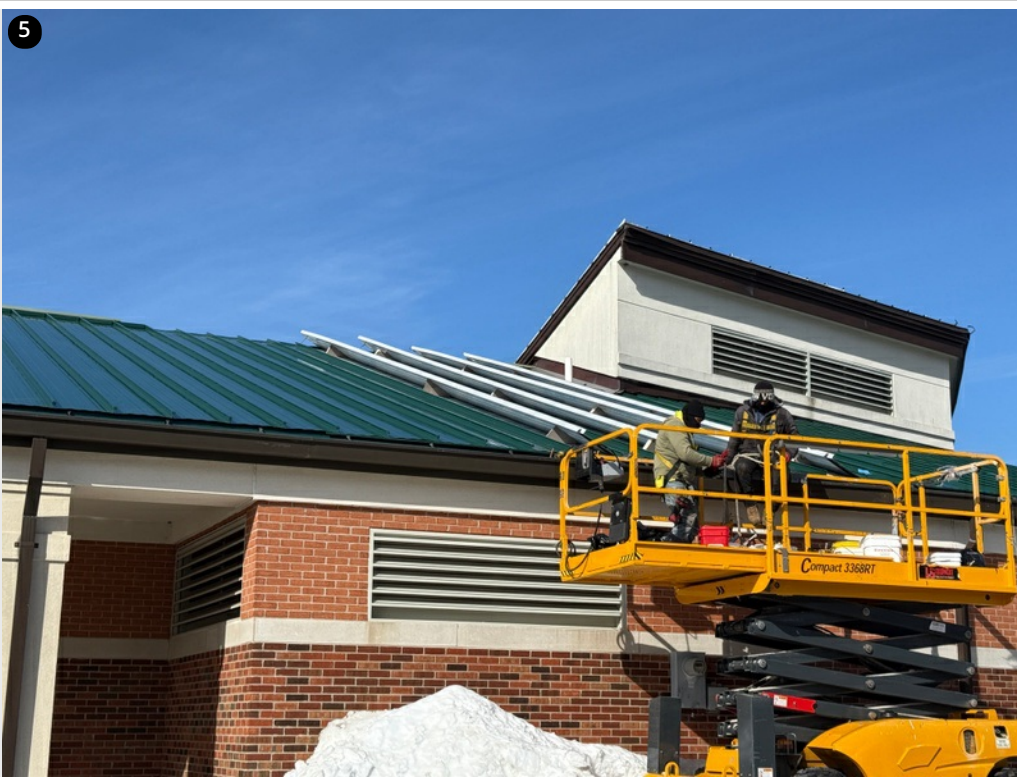
Crew starting fastener replacement on the back of the kindergartener wing