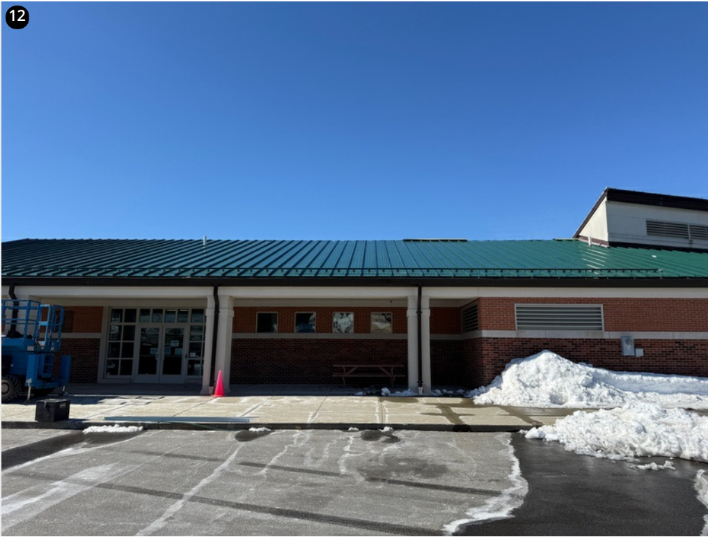
Overview of the kindergarten wing completed fastener replacement