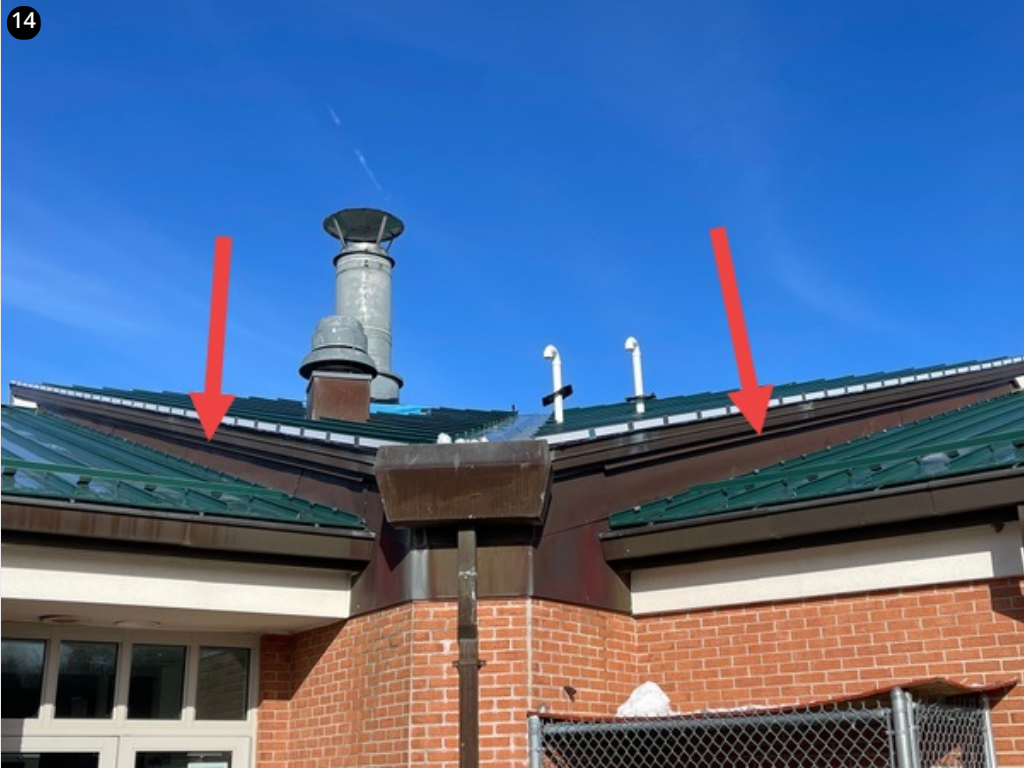
14 Due to existing cop flashing, the question of what to do here and what color is outstanding.