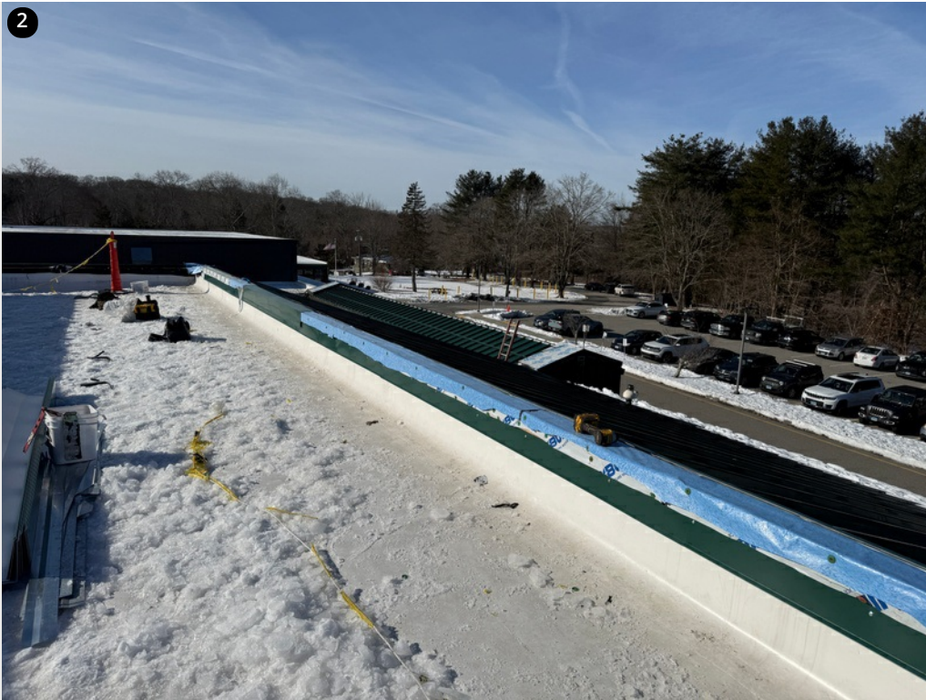
Overview of the blocking wrapped