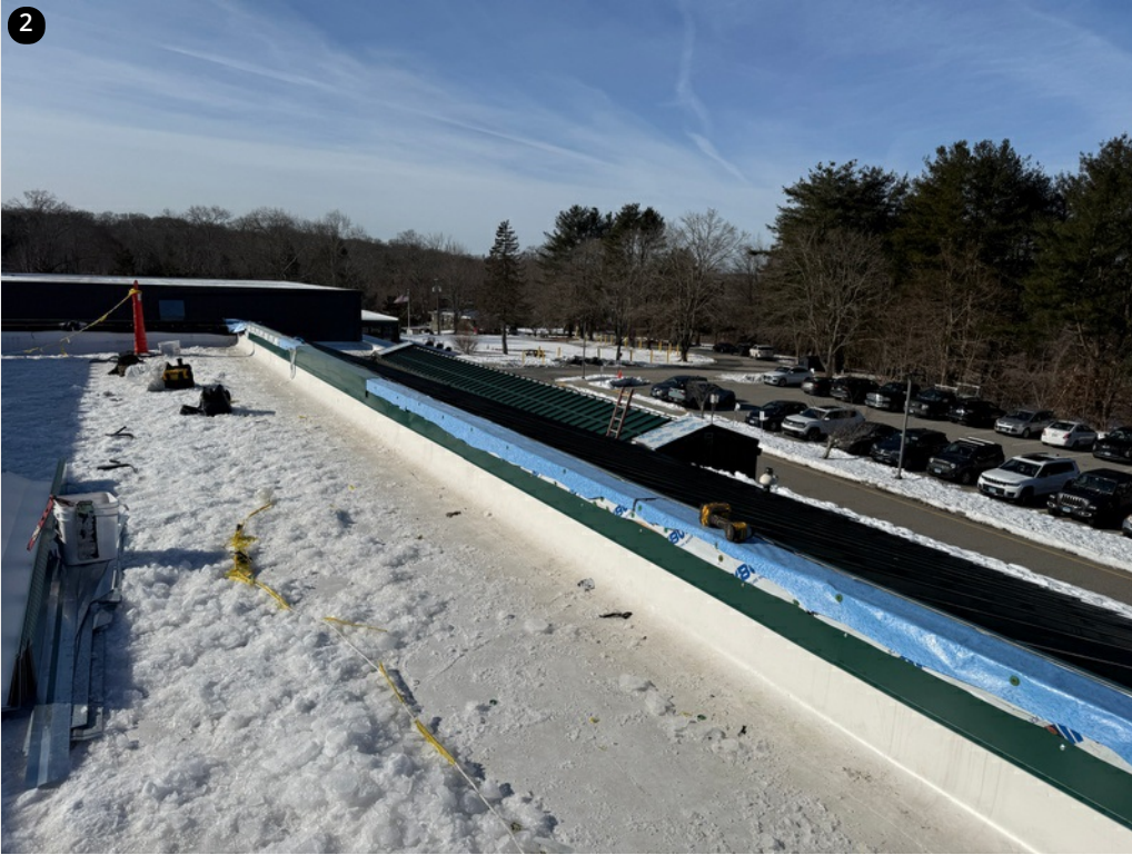
Overview of the blocking wrapped