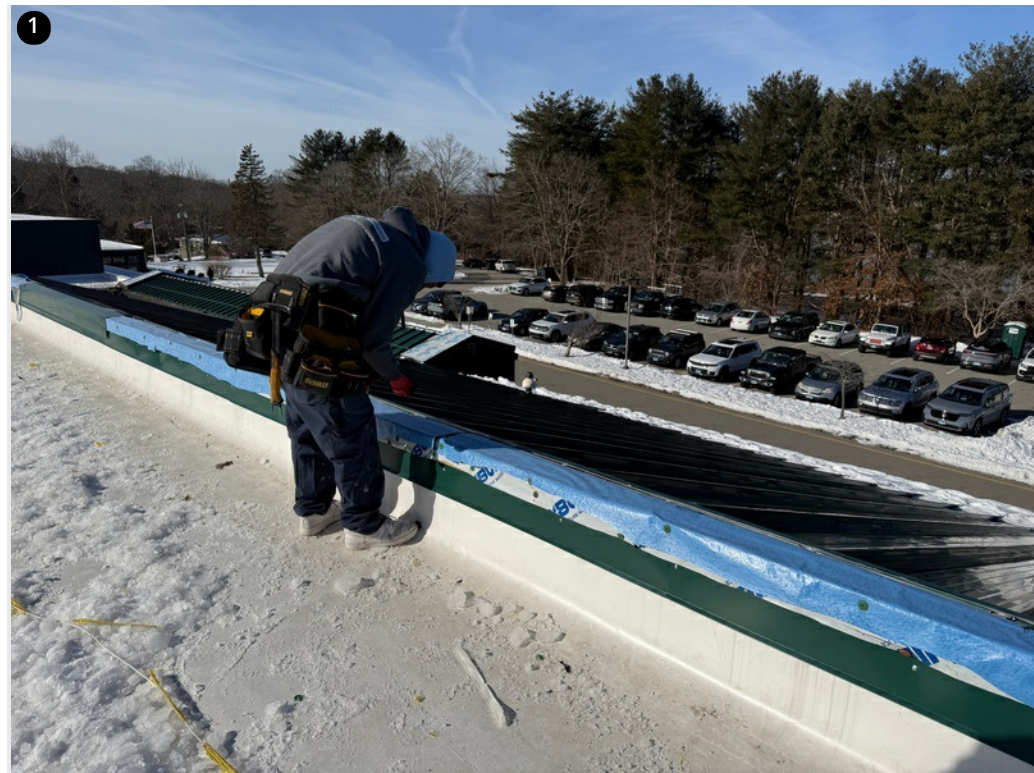
Working on the low slope to slope head detail

On Wednesday, the crew was installing head enclosures on the front section of the school near the bus loading/dropoff zone. Crews were also working on fastener replacement on the kindergarten wing and finished the majority of the replacements on Saturday. Note: "8" fasteners will switch to black due to a lack of red fastener availability" The week ahead looks good weatherwise which means crews will continue on trim work and fastener replacement on the gym section. Sincerely, Brendon Johnson - bjohnson@garlandco.com - (860)227-7946 Jeremy Cogdill - jcogdill@garlandco.com - (802)598-2974