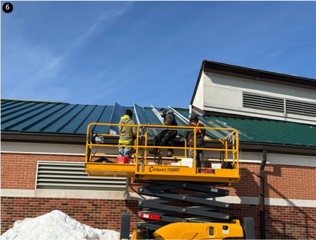
Verification of clip spacing and 7" fasteners existing, the crew is installing 8"