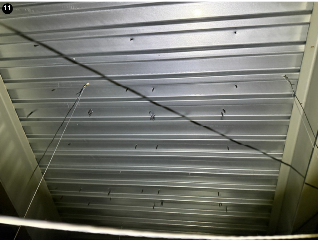
Proper deck fastening pattern with 8" fasteners