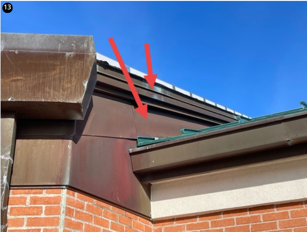
Area of detail question with the SD