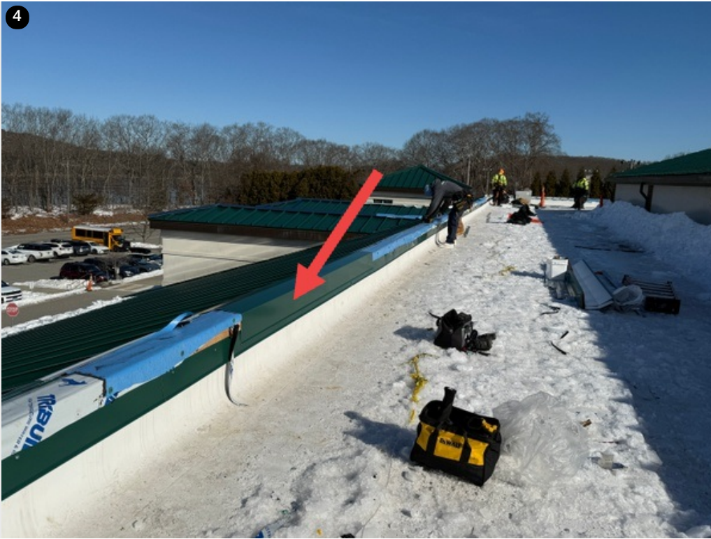
Wrapping closure piece