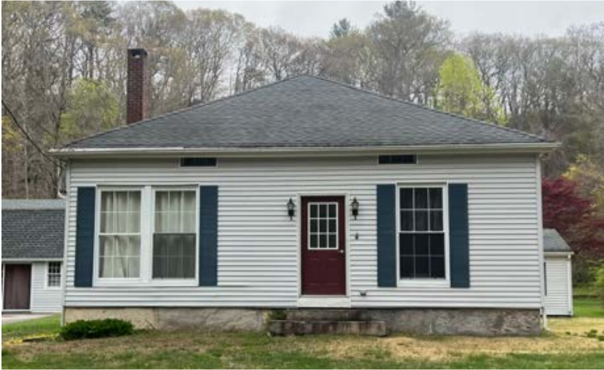
Stoddard house, Bungalow w/ hip-roof 1850