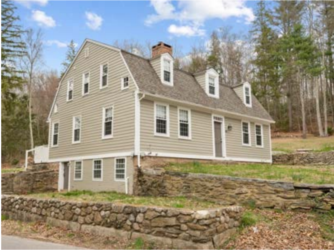
Perkins-Bill House, Cape Cod style, pre-Revolutionary era