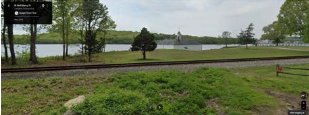
Harvard Boathouse 1878