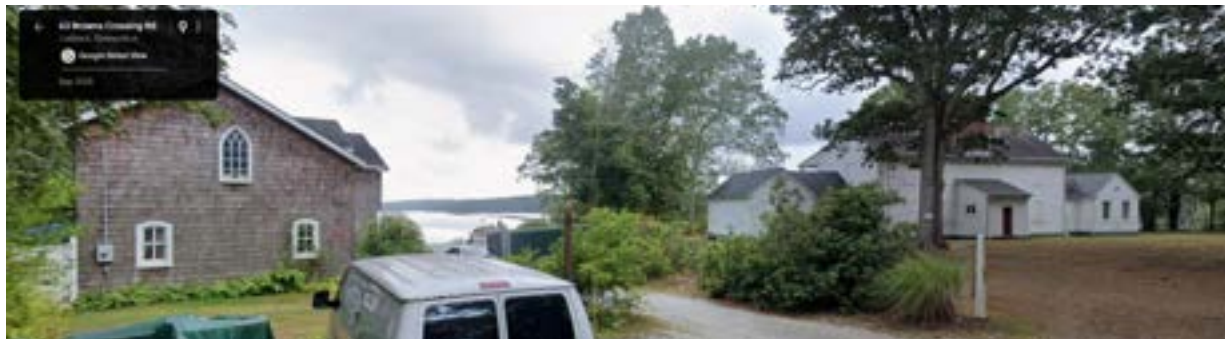
Peterson house 1937 (gothic window is new)