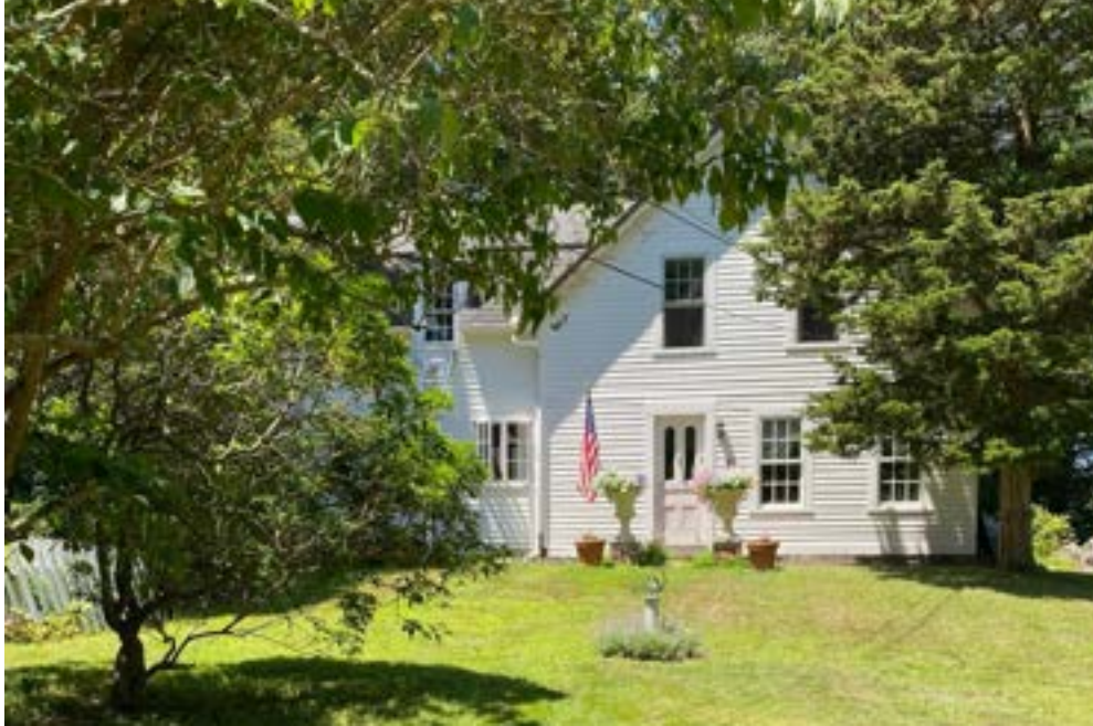
"Pinelock" farm house original ca 1810, later house 1890