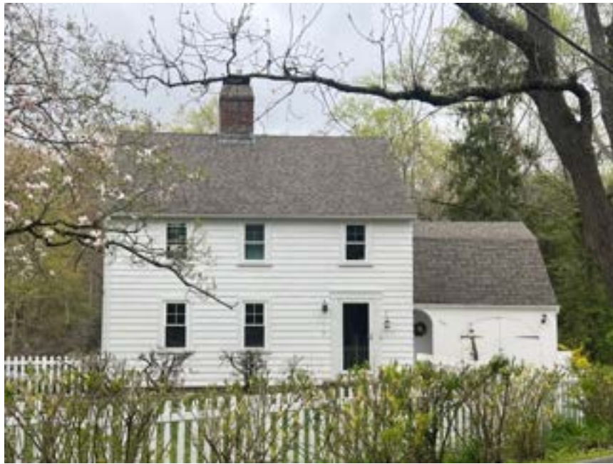
House, Colonial Revival ca 1930 built on Winthrop Mill site