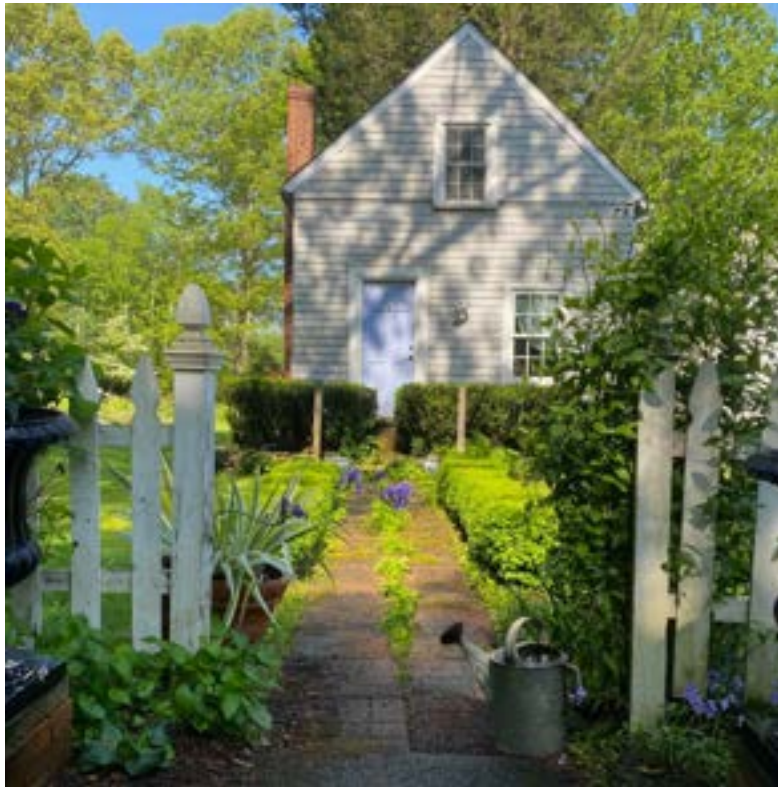
"Juniper" Cottage - originally a toll house, moved from Toll House Rd Groton using oxen