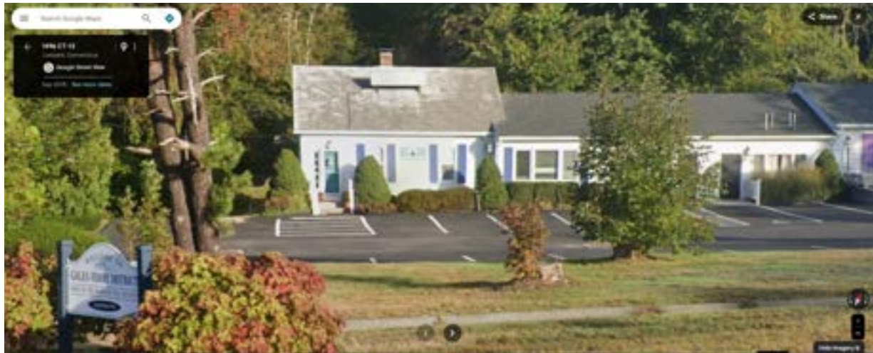
District #1 Schoolhouse