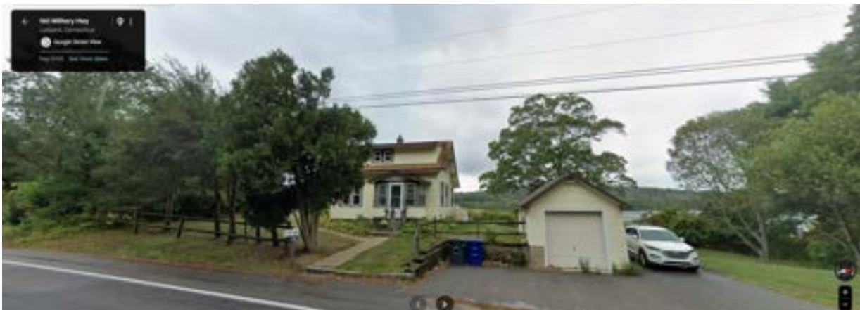
Perkins house ca 1820s