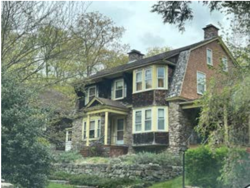
Henry Singlewood Bisbing house, American Craftsman style 1910