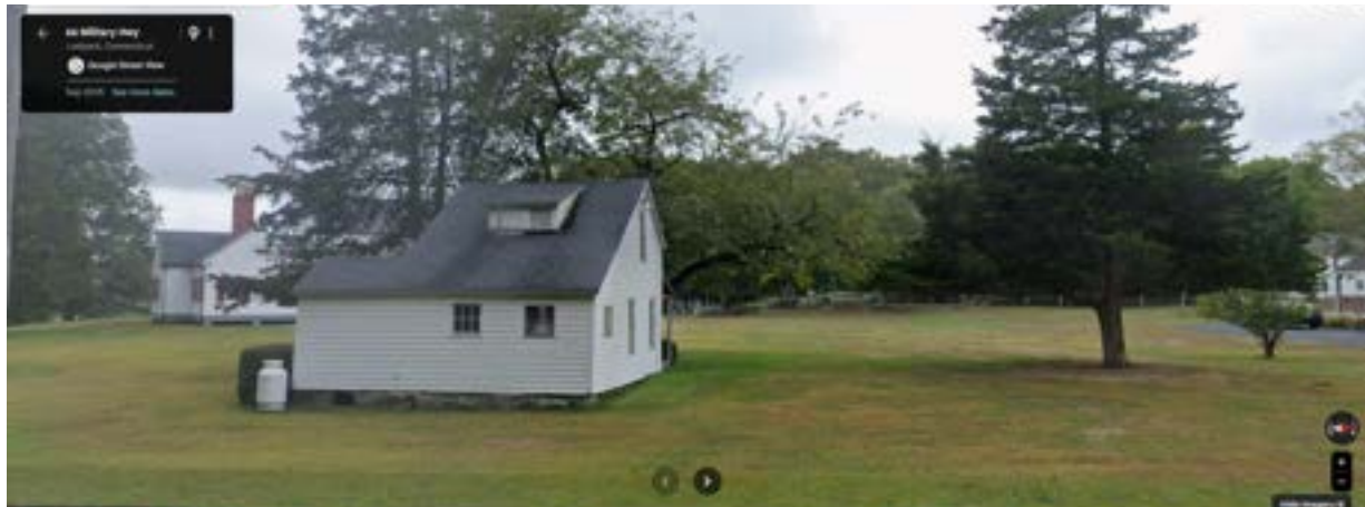
Caretakers house 1700s