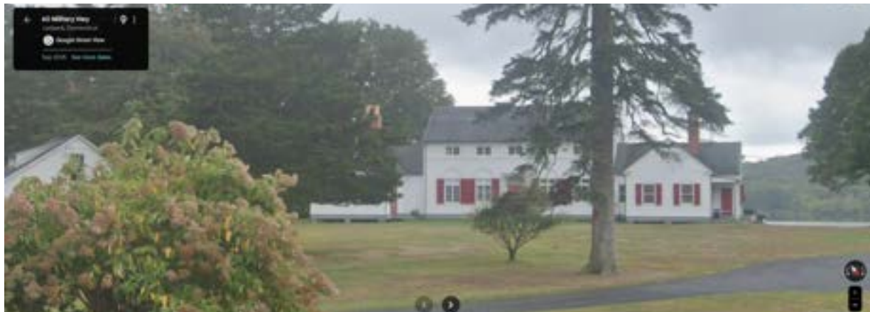
Harvard Messhall ca 1880