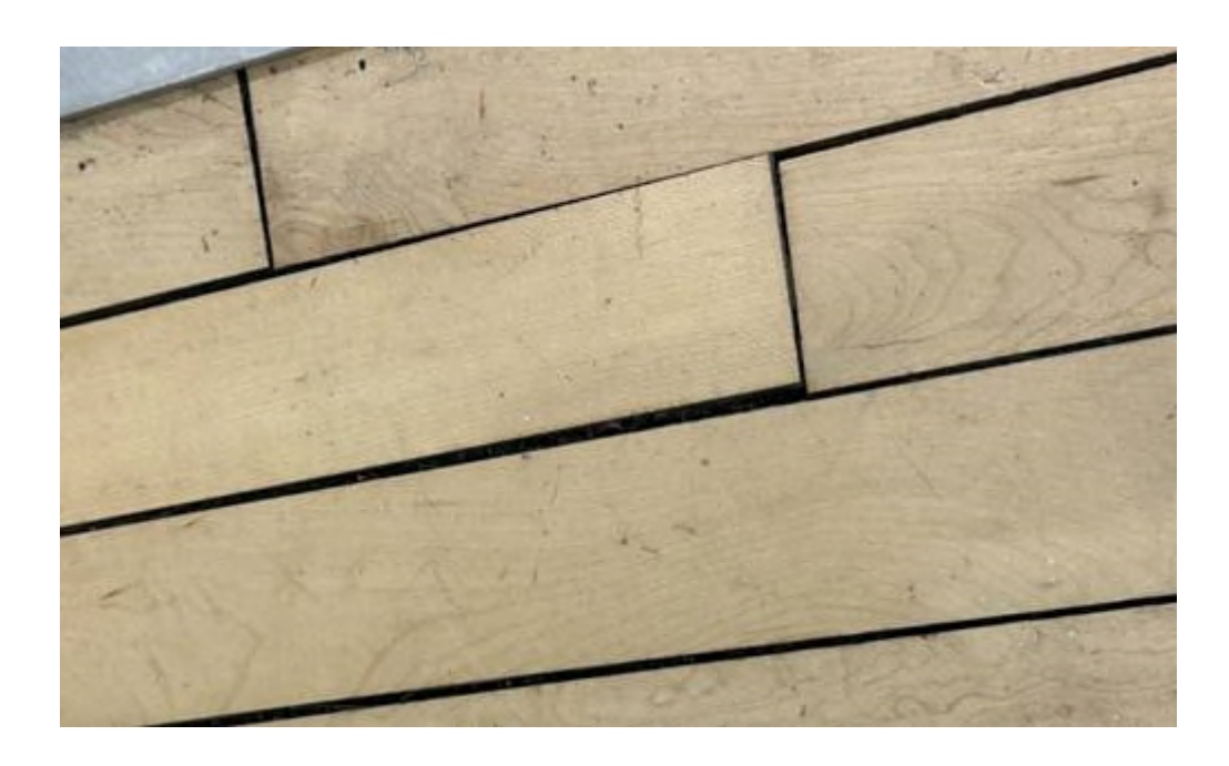
Floor boards separating and even breaking apart.