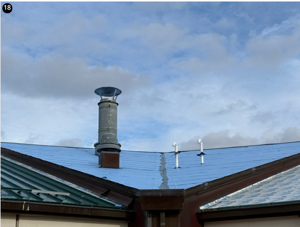
New ice and water layer adhered above boiler room section- 1/16/25