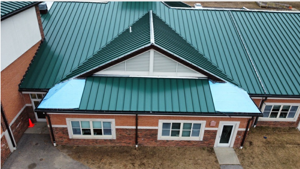
New ice and water layer adhered under large dormer area- 1/18/25