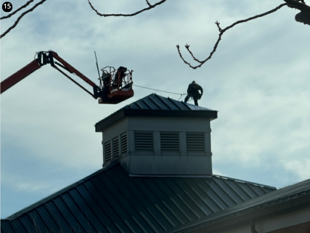
15 Crew installing panels on small copula- 1/16/25