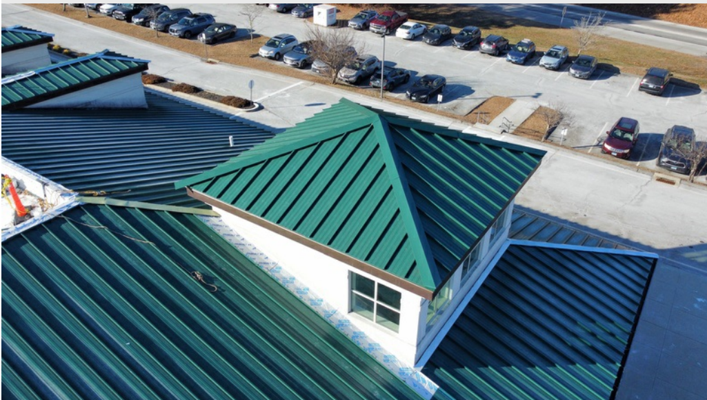
Large copula completed- 1/14/25