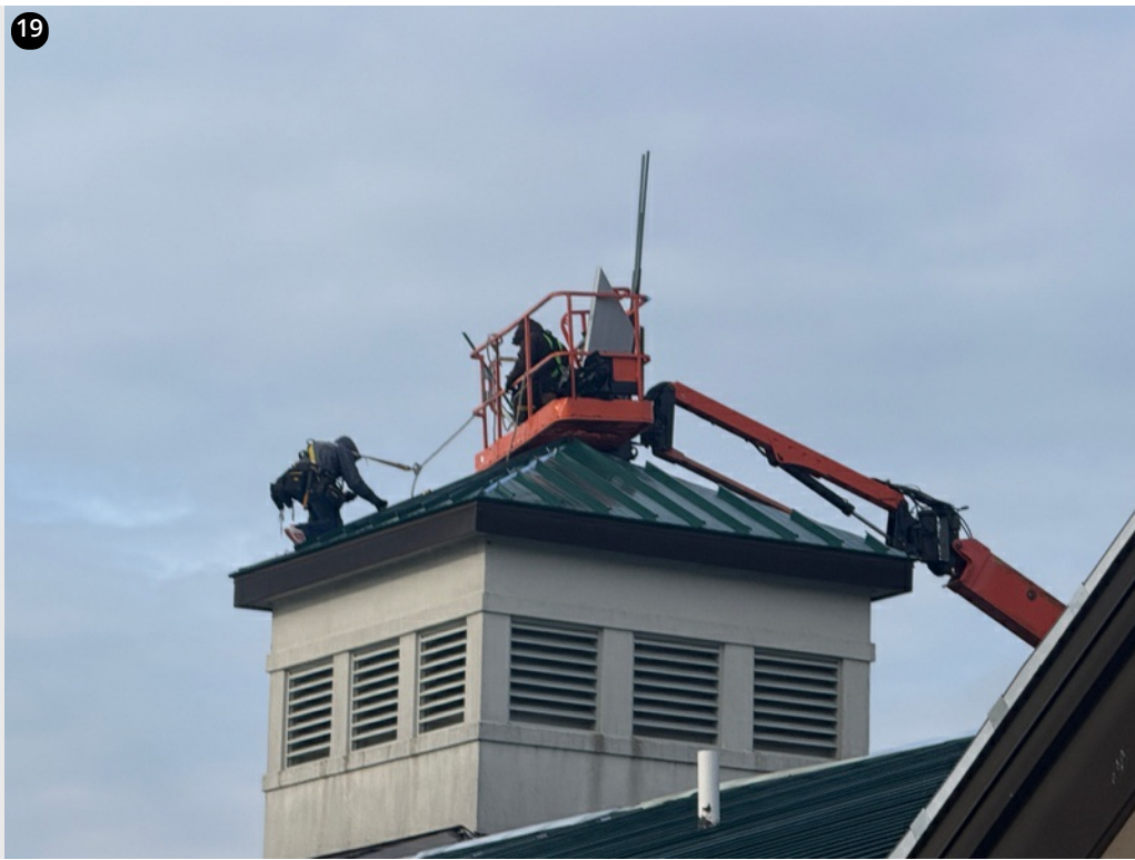
Crew installing panels on small copula- 1/17/25