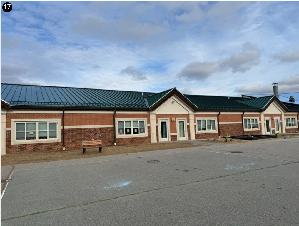
Snow guards installed on playground side- 1/16/25