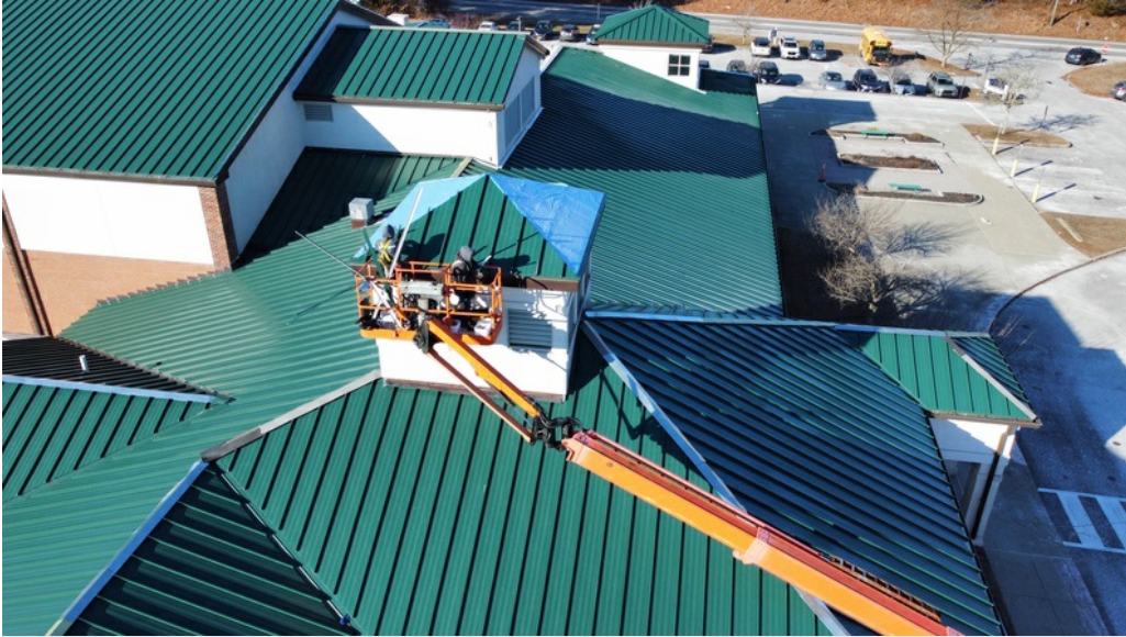
Crew installing panels on small copula- New ice and water layer adhered- 1/14/25