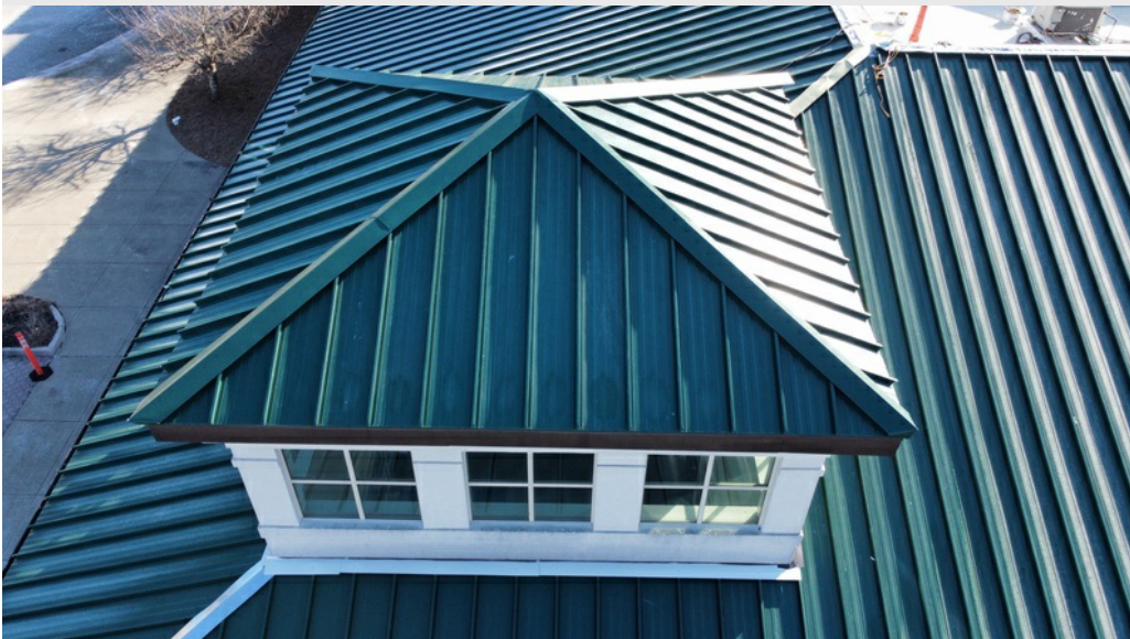
Overview- Large copula- 1/14/25