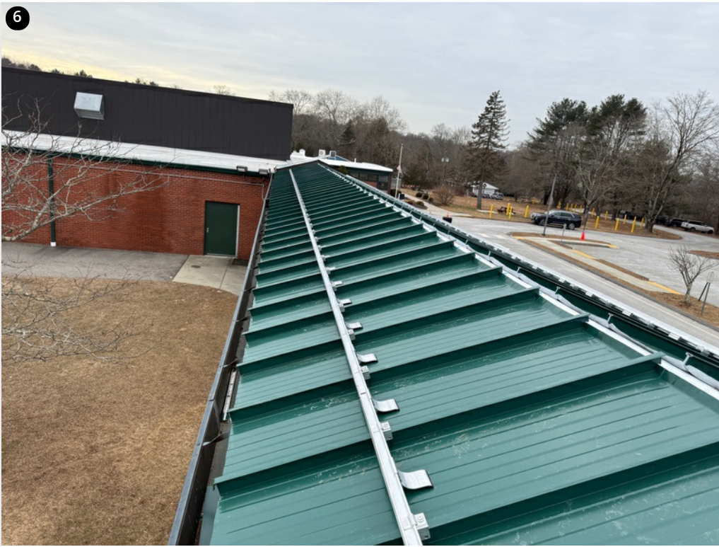
Snow guards installed on walkway roof- 1/13/25