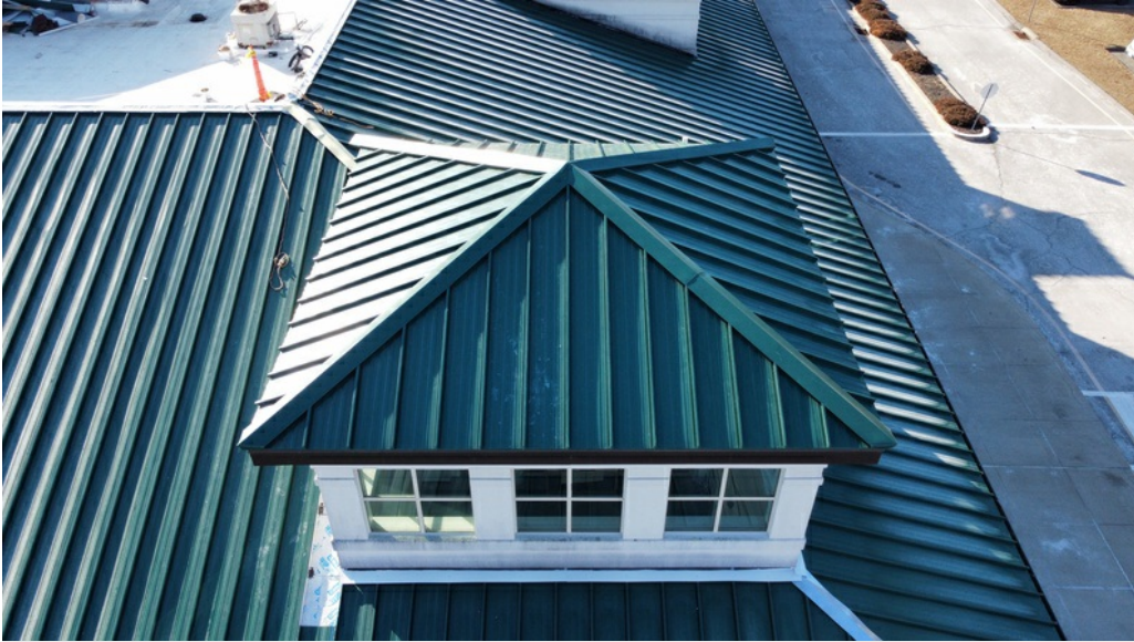
Overview- Large copula- 1/14/25