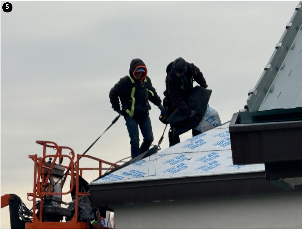
Crew removing loose and expired ice and water layer on small copula- 1/13/25