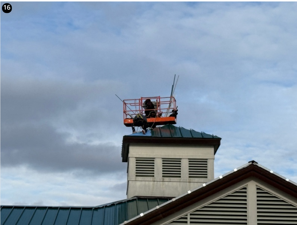
16 Crew installing panels on small copula- 1/16/25