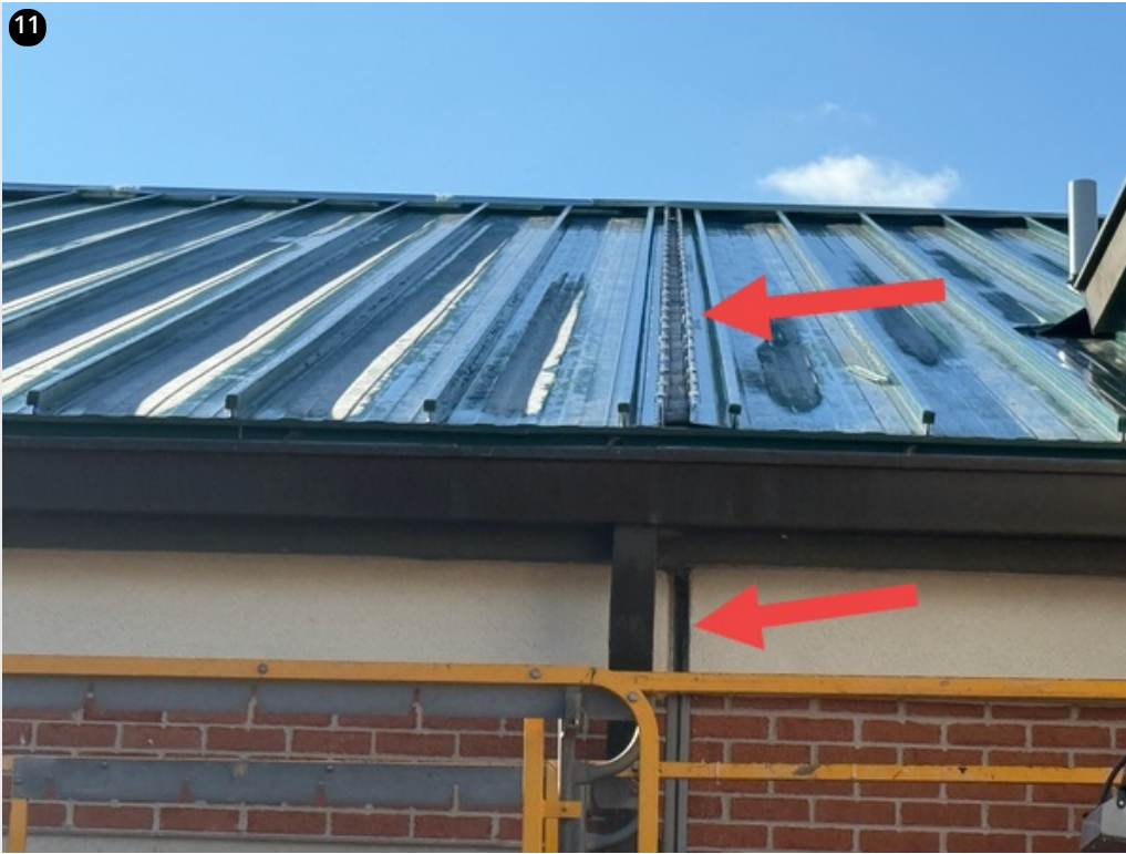
Gable clips installed on both sides of expansion joint- 1/14/25