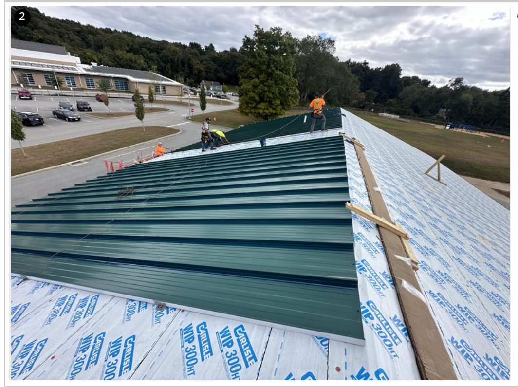
Crew fastening clips on field area