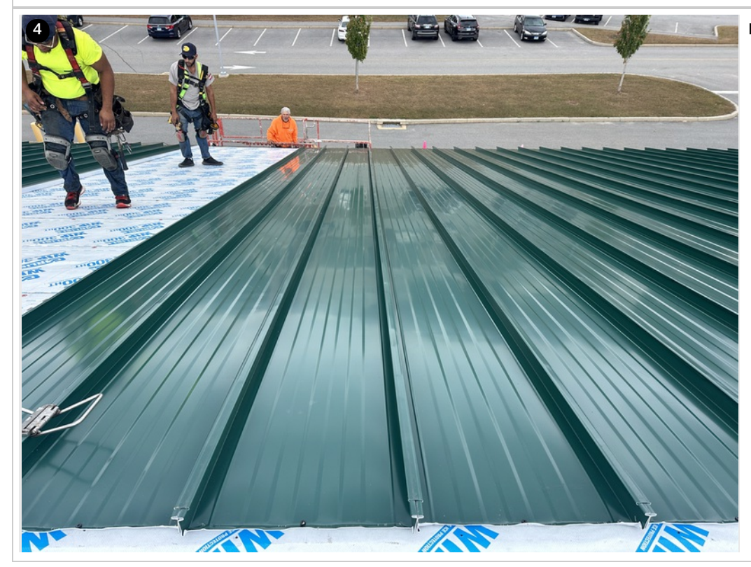
Installed panels- No oil canning