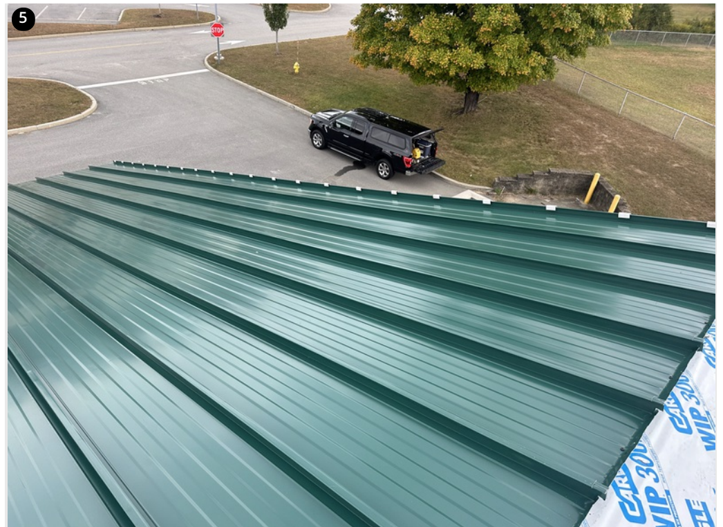
Perimeter edge zone- Clips spaced at 1'5" per spec