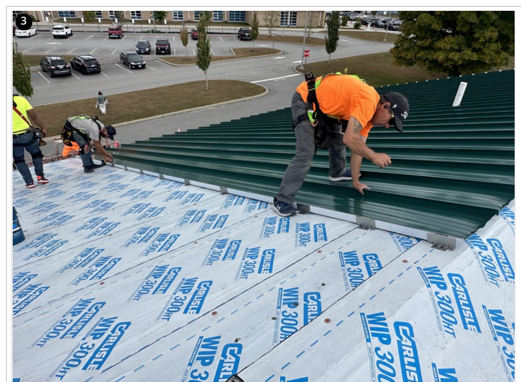
Field area- Clips spaced at 2'4" per spec