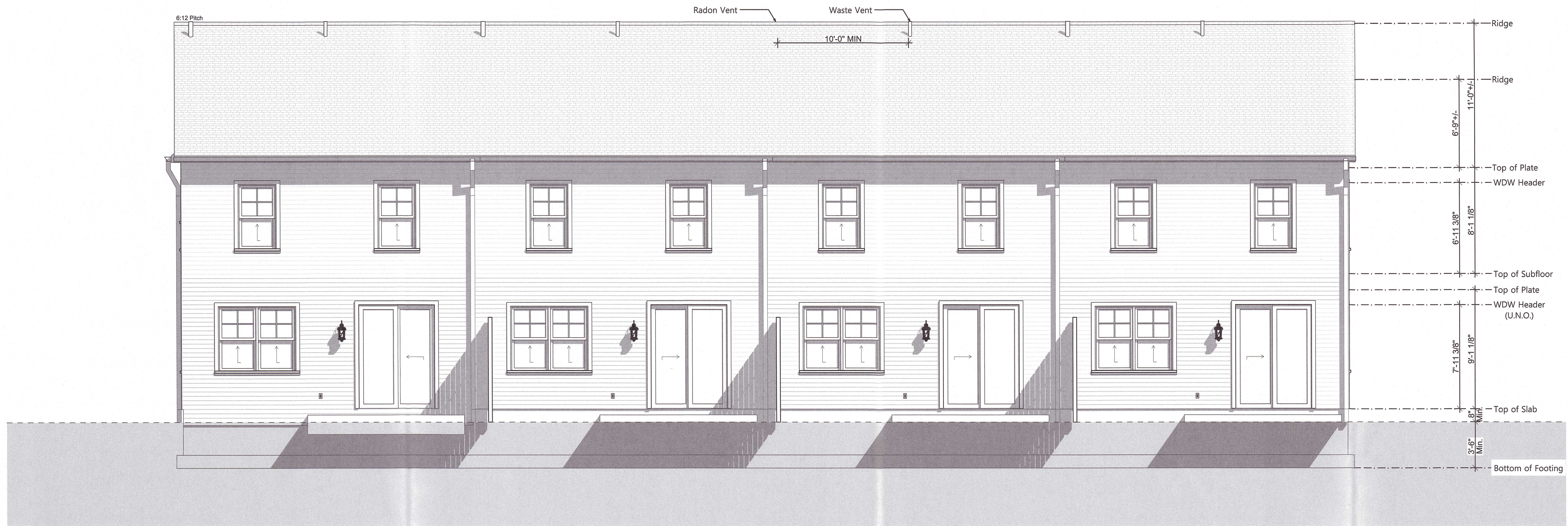
1 Rear Elevation SCALE: 1/4" = 1'-0"