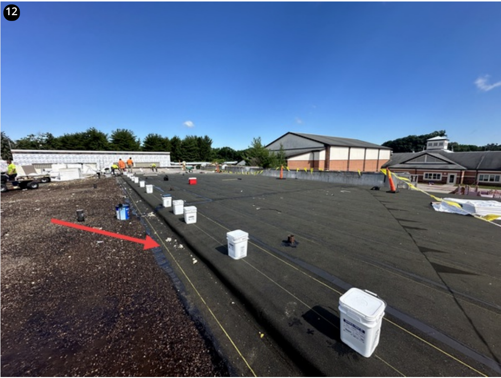
Night tie-ins complete and weighted