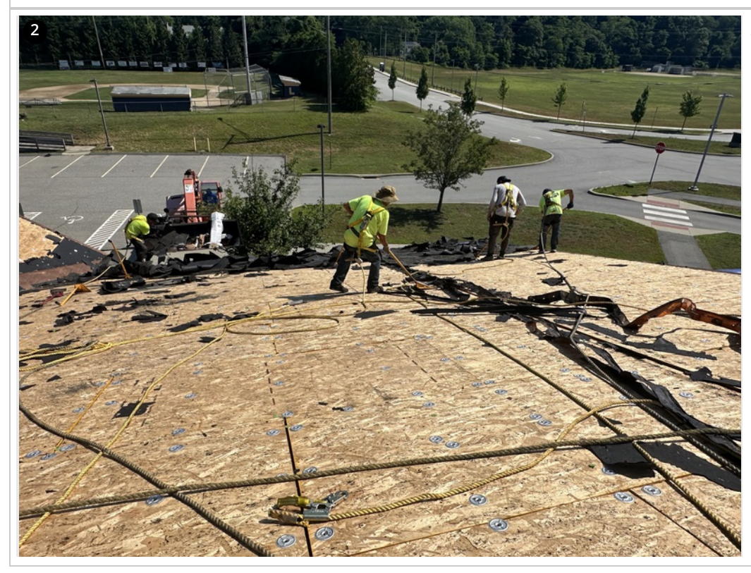
All crew following proper safety precautions- Harnesses, tie offs etc