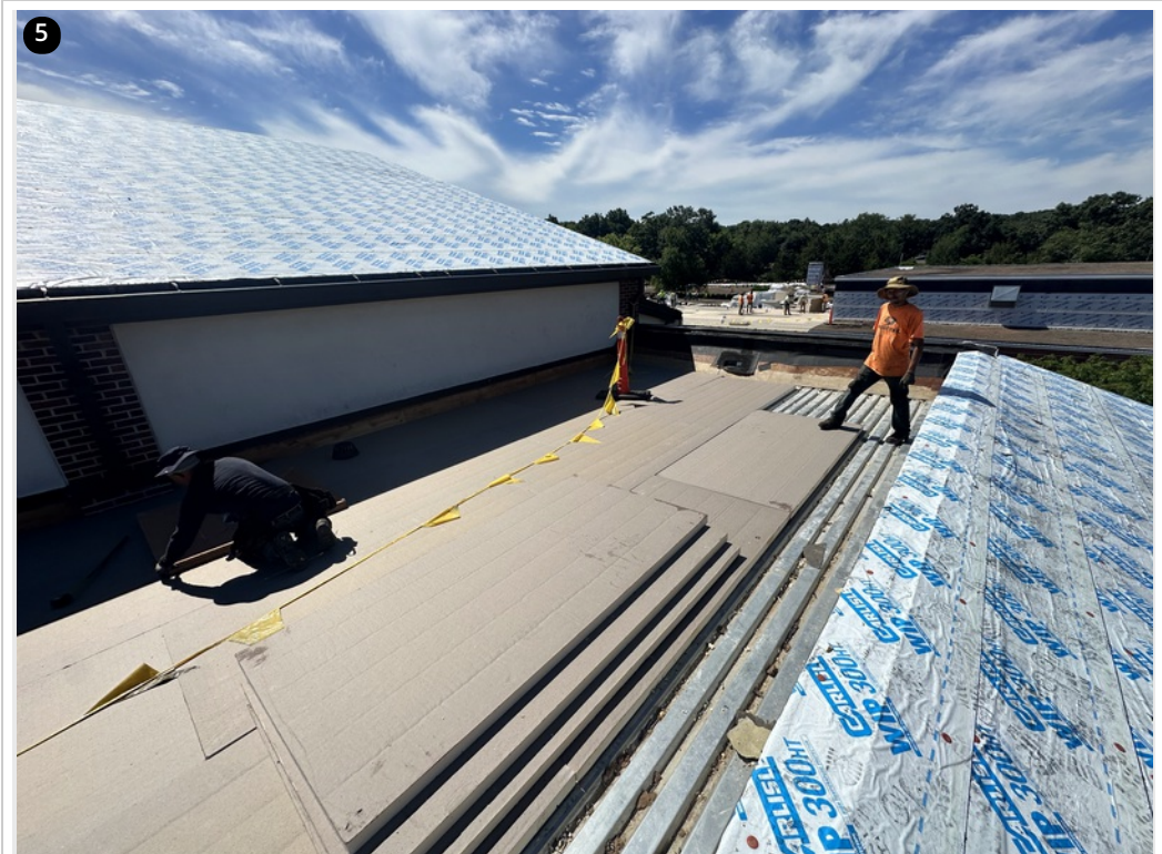
EPDM section ripped to metal deck- Crew laying out insulation boards