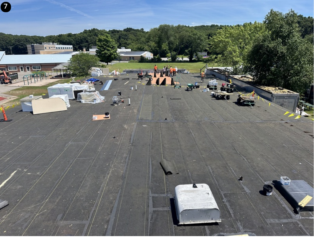
Overview- Crew installing base sheets on final area of playground side