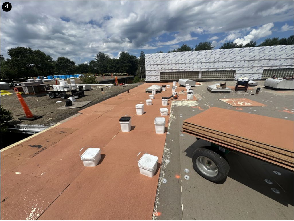
4 Crew using buckets of fasteners to weigh down adhered cover board