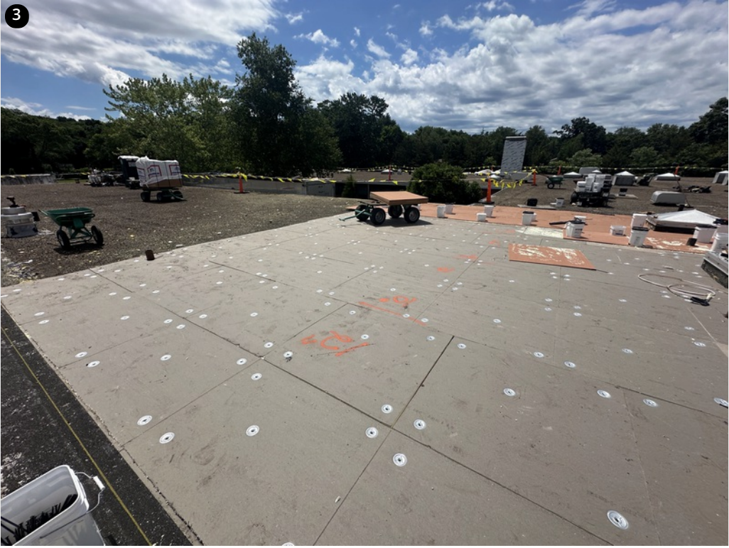
3 Overview- Fastening pattern on insulation boards