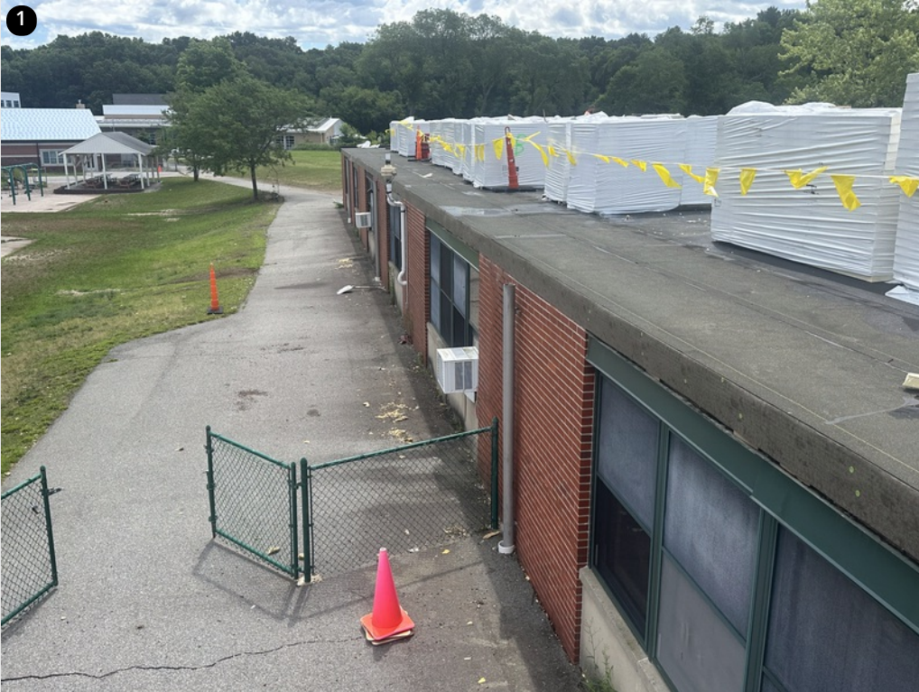
1 Exposed decking detail on perimeter temporarily fixed- No new leaks have been observed