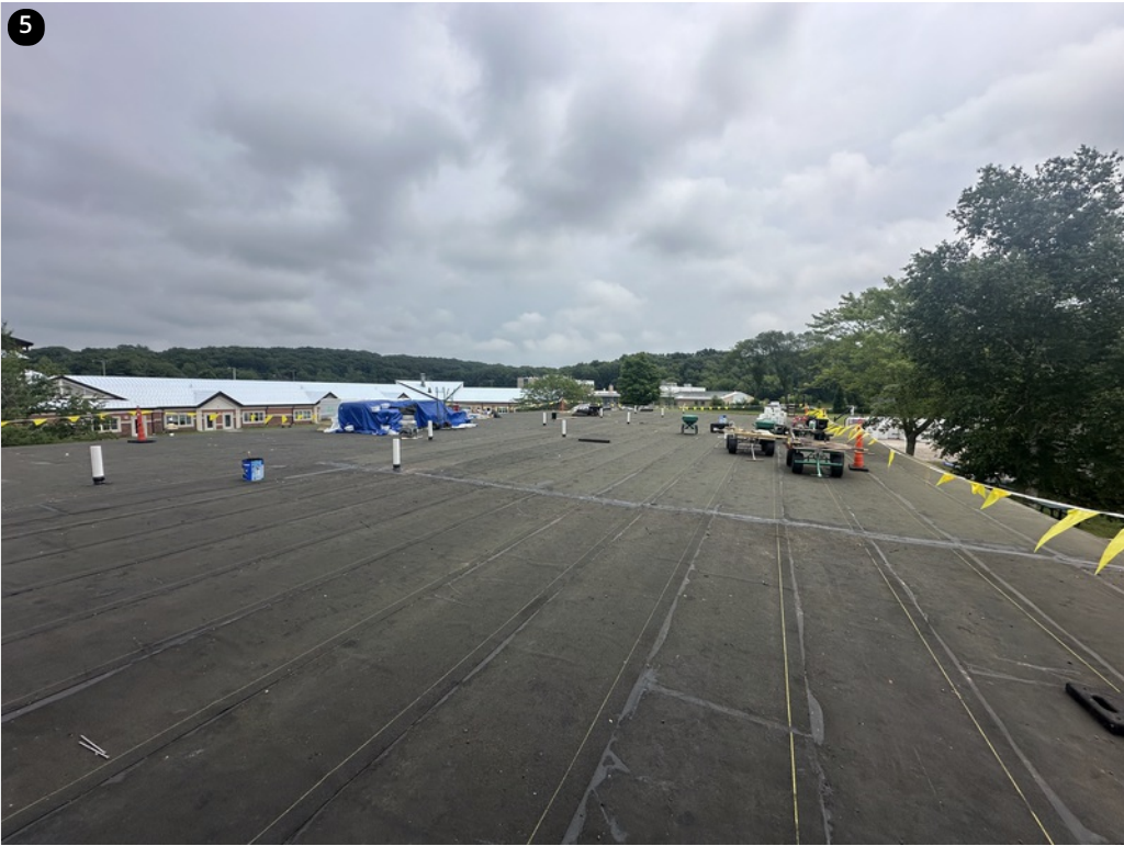
Overview- Completed base sheets on playground side