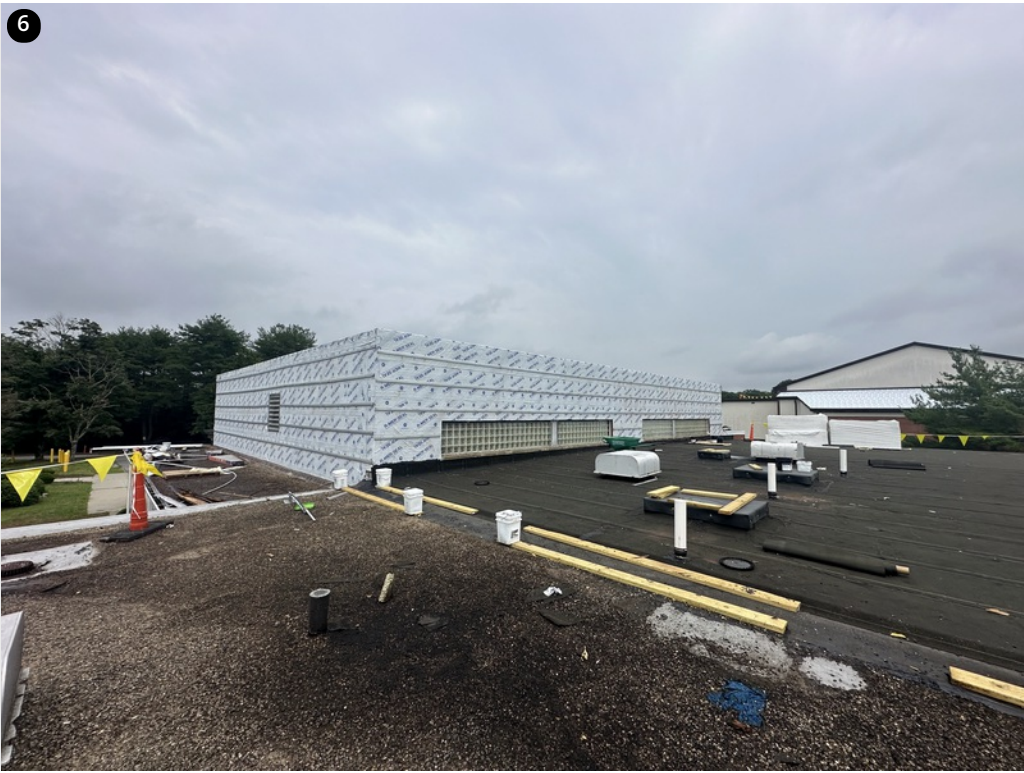
Masonry wall completely covered with ice and water- Hat channels installed