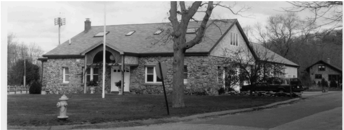
Rustic - 1 ½ story gabled roof and cross-gabled garage extension - Fire Company No. 2, 1948