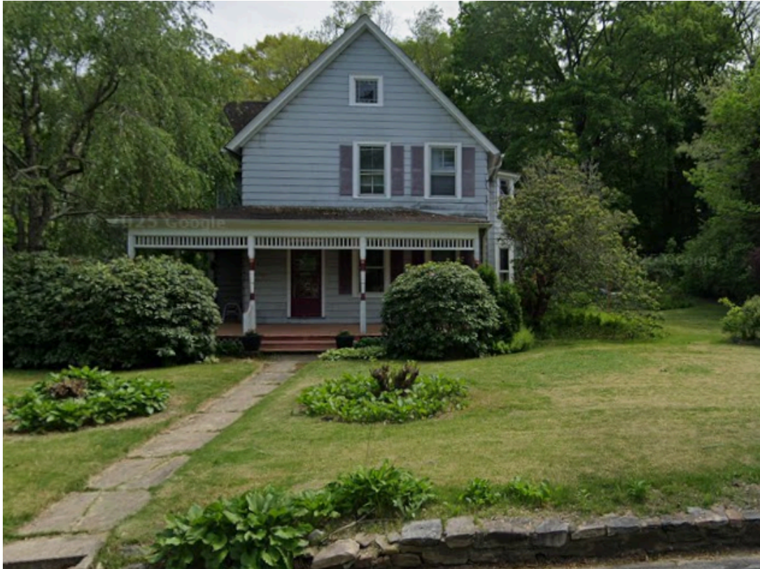
19th-c vernacular 2-story gable w wrap-around corner porch - Adelbert Alexander House, 1899