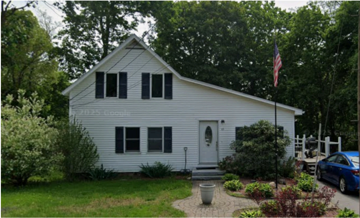
Vernacular - 1½-story gable-and-shed roof, 1900, moved to present location 1927