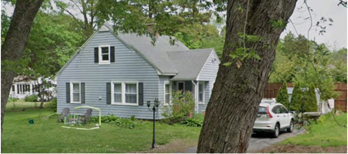
Mid 20th-c Cottage Vernacular - 1½-story gable w cross box-gable entryway, 1950