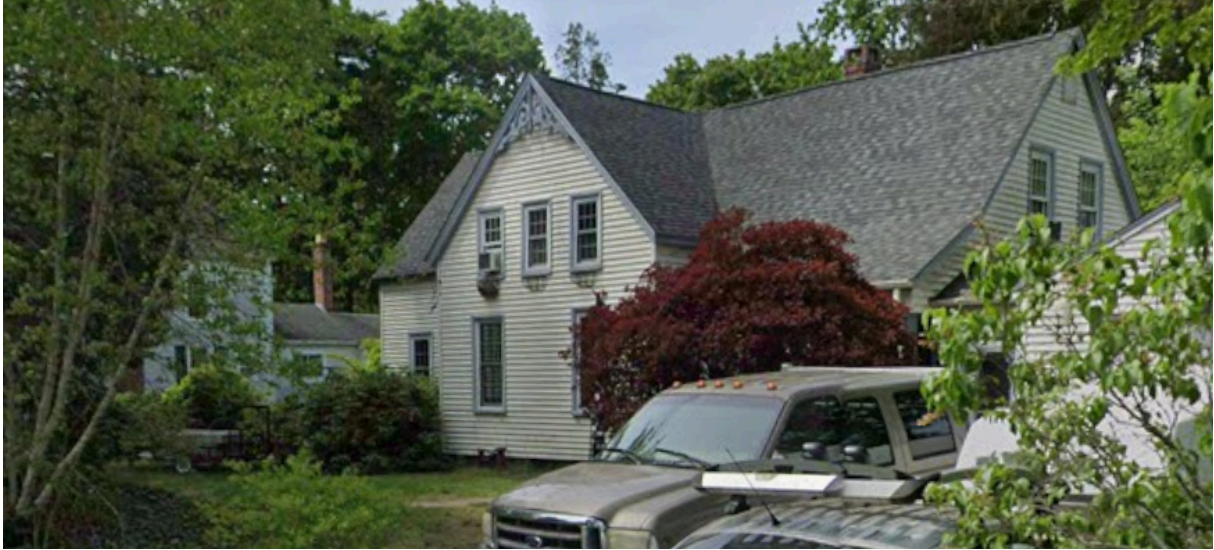
Vernacular - Henry Comstock House; cross-gable 1½ story post-and-beam, 1848