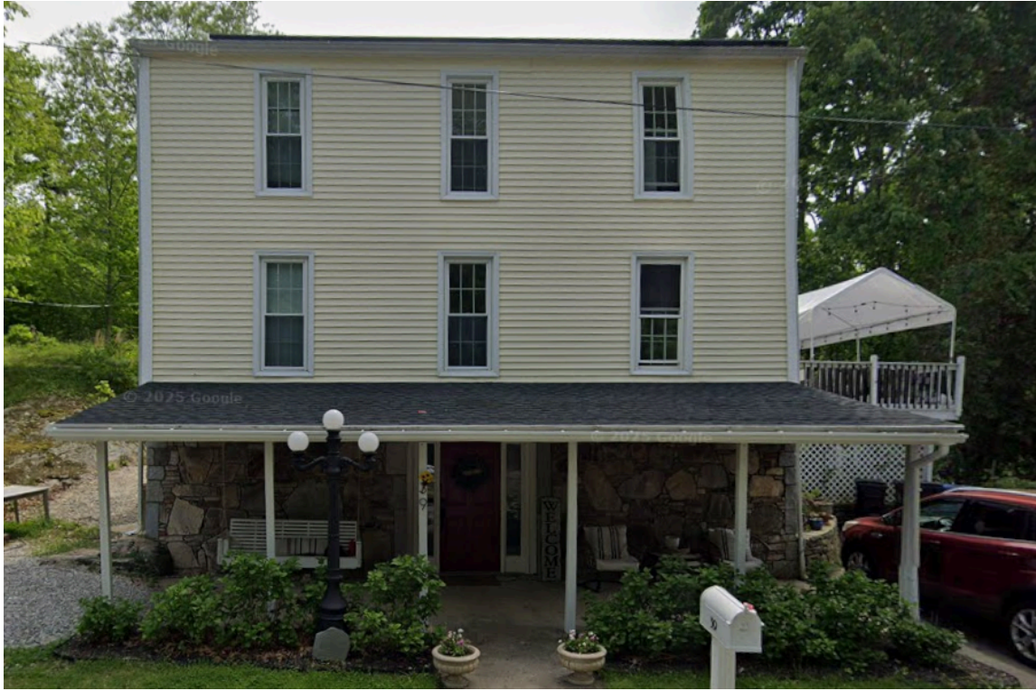
Mid-20th c 2-story gable w rustic field stone veneer foundation and full-front portico, 1940