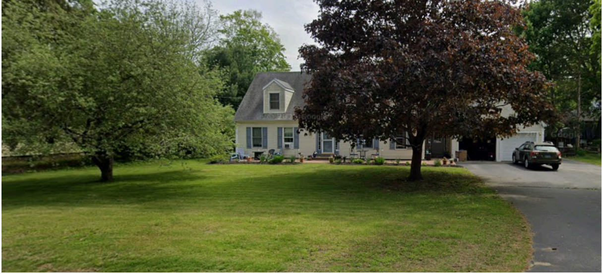
Colonial Revival - 1½ story high-gable, 1988