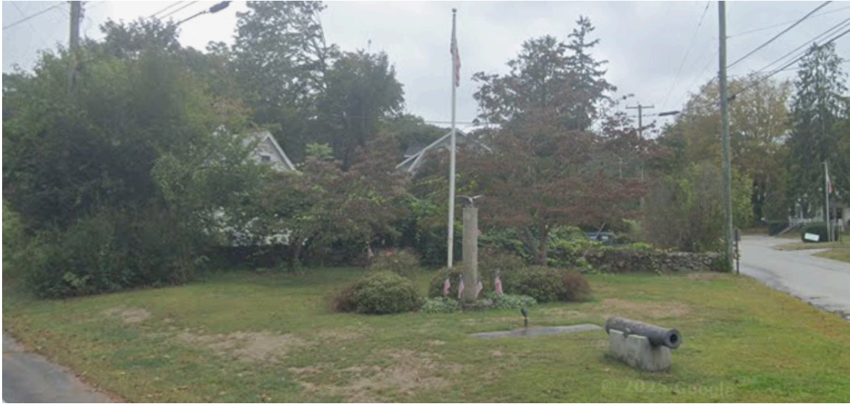
Gales Ferry Memorial Parklet, 1920 rededicated 1942 & 1956