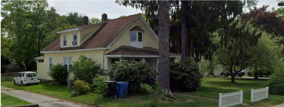
Colonial Revival - 1½ story gable w shed dormer; 3-bay window over hipped porch, 1930