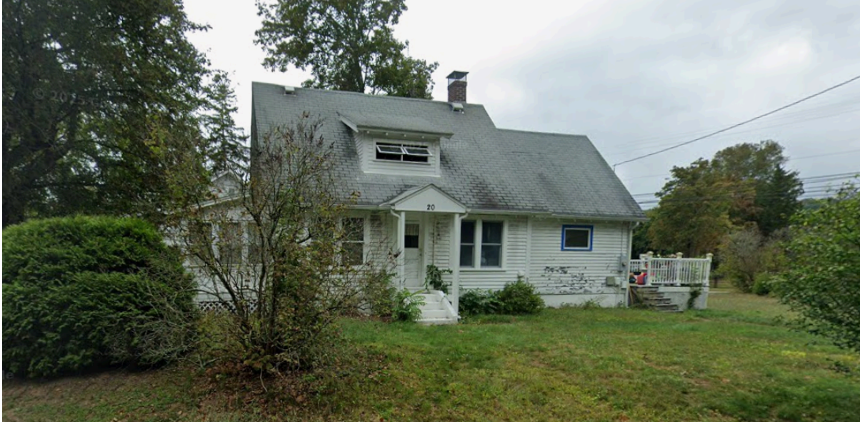
Colonial Revival - Gable w shed-roofed dormer and side addition, gabled front entranceway, 1948