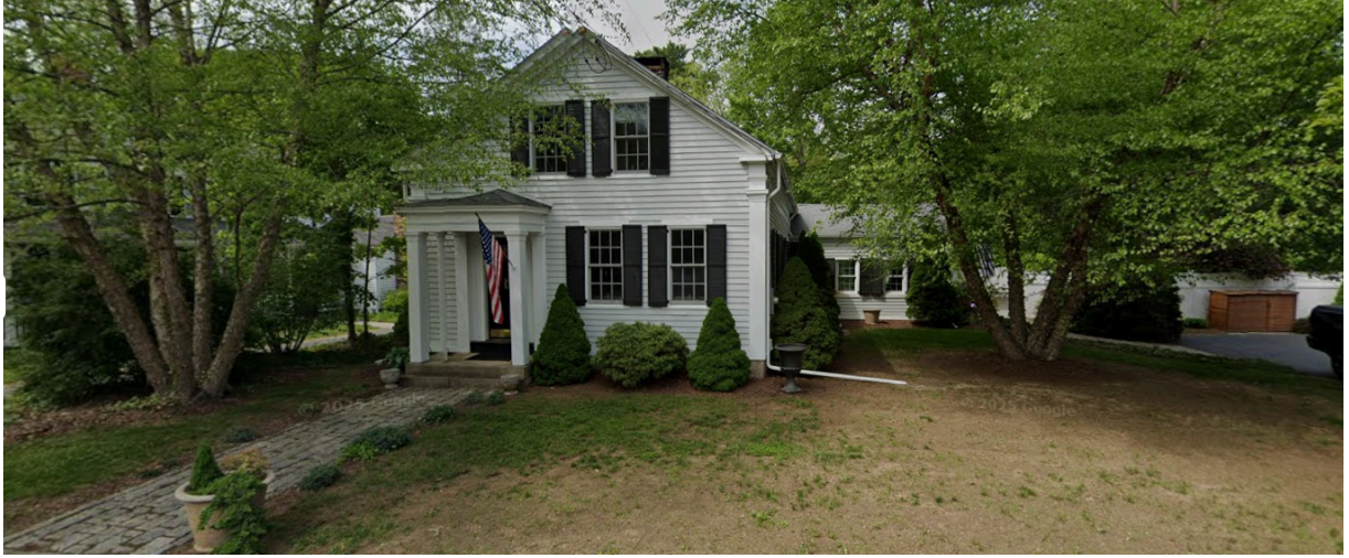
Greek Revival w corner pilasters - Stephen Perkins House, 1845