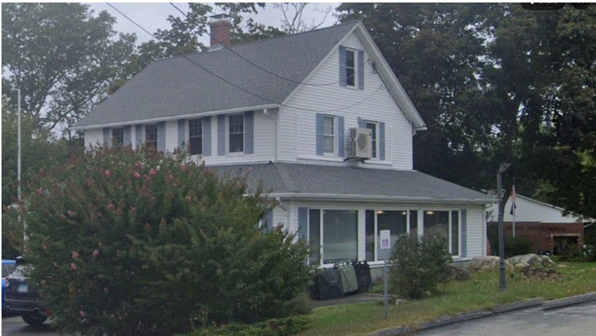
Colonial Revival - groundfloor addition was likely originally a hipped corner veranda - Former Methodist Church parsonage, 1928