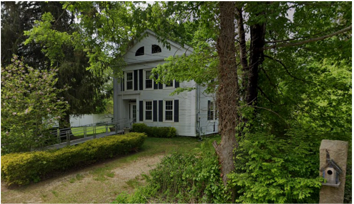
Greek Revival - Orlando Bolles House; 2-story post-and-beam, 1847