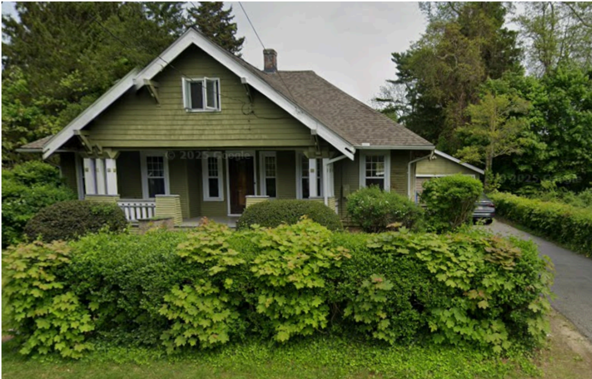
Sears Roebuck "The Elsmore" prefab 1½-story hipped Bungalow with box-gable covered porch entrance - Jacob Schnell House, 1917