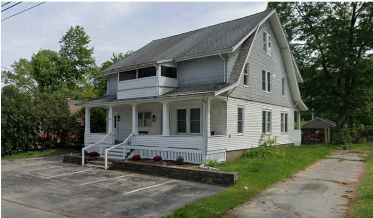
2½ story high-gable w/ shed-roofed dormer & Dutch gambrel eaves, 1930