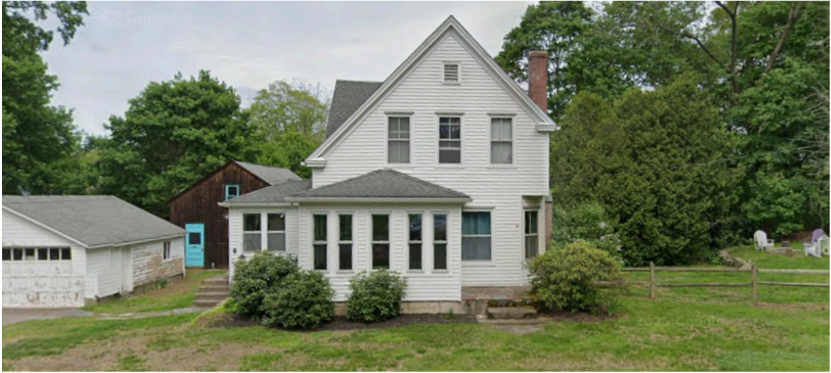
19th-c vernacular 1 3 / 4 -story saltbox w gable dormer and hipped enclosed porches - Lucy Perkins Hurlbutt House, 1896/1899