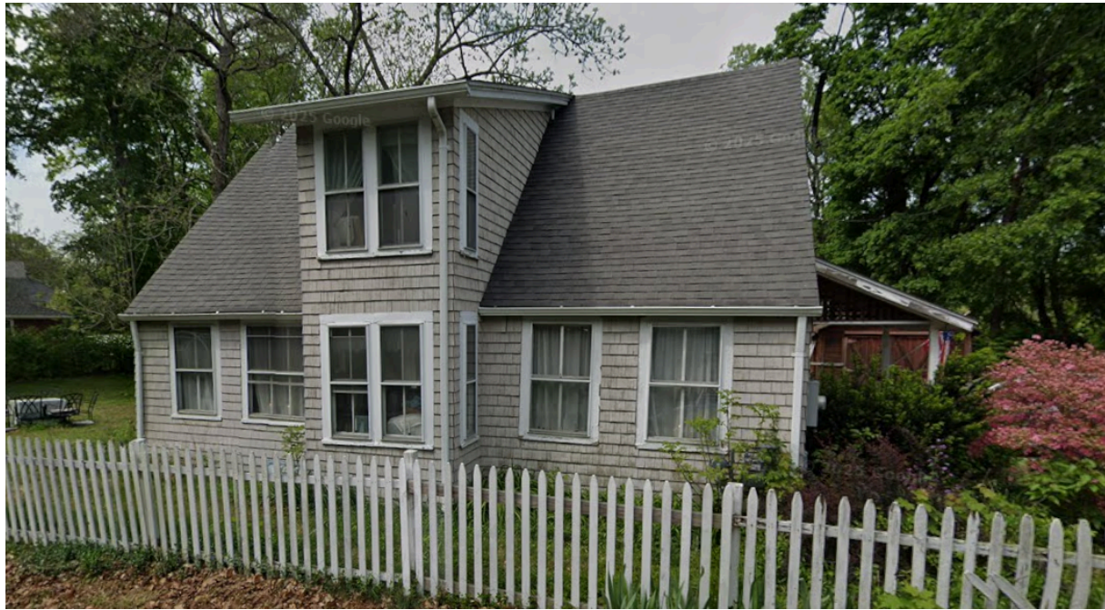
Colonial post-and-beam w newer central bay addition - Stephen Hempstead House, 1826