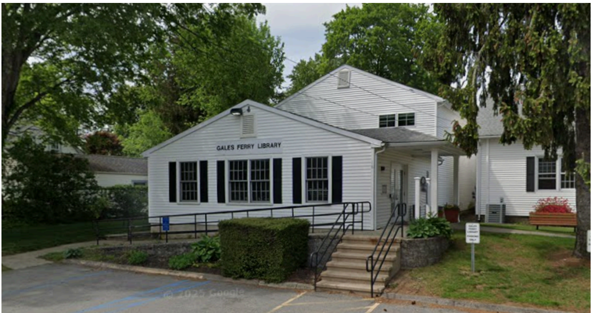
Colonial revival - Gales Ferry Free Public Library, 1974