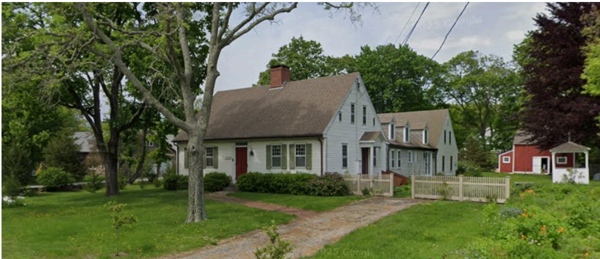
Colonial - Williams-Allyn House, 1803

Gales Ferry's National Historic District #2 lies mostly along Hurlbutt Rd east of the railroad cut. It consists of 19th-century houses associated with the ferry, wharves, and seafaring commerce of the Thames River; 20th-century houses built, in part, as summer residences during the village's development after the arrival of the railroad; and civic buildings constructed to serve the community needs of the village. There are thirty-one 19th-century structures, twenty 20th-century buildings more than 80 years old, seven civic/community buildings, a cemetery, and a small park. 1