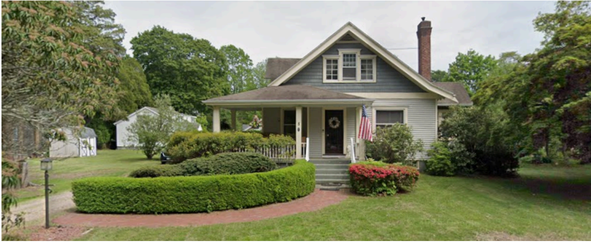
20th-c vernacular - 1½-story Bungalow w bell-cast gable roof, gabled dormers and additions, hipped corner porch - Reverend Allen Shaw Bush House, 1916