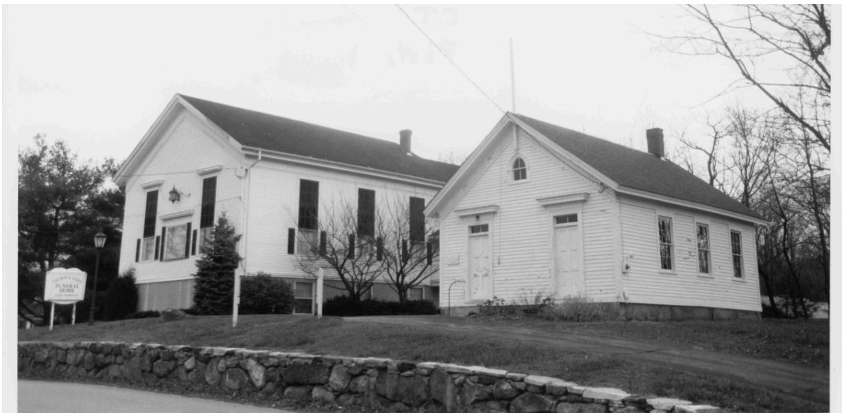
19th-century vernacular - Gales Ferry Methodist Church, 1857