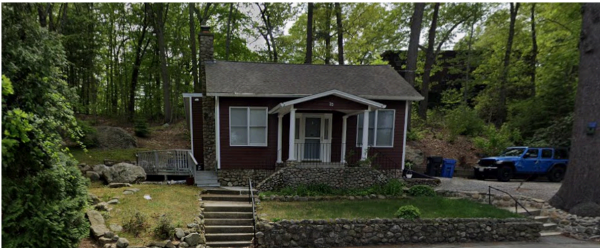
Rustic 1-story gable w cobble stonework foundation, porch & chimney - First Gales Ferry Library, 1921