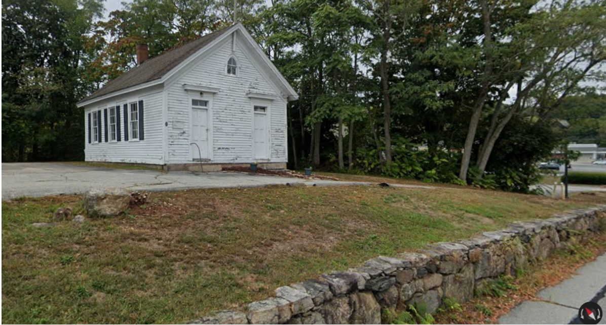
19th-century vernacular - Gales Ferry School, 1868