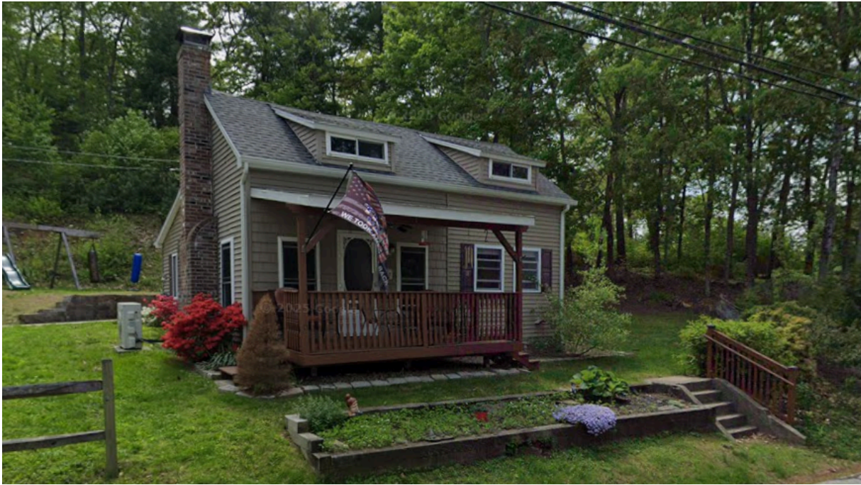
Vernacular gable w shed-roof dormers & rear addition - Twin Oaks, 1908