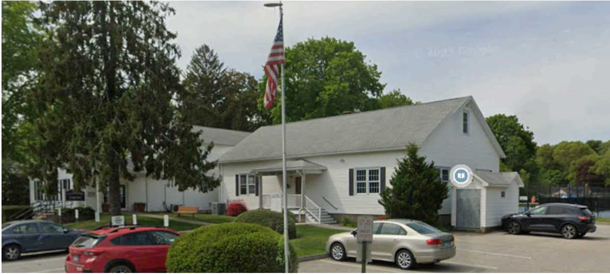
Early 20th-century vernacular w hipped-roof entry - Gales Ferry Community Center, 1927