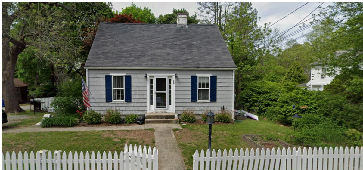
Colonial Revival - 1½ story gable-roofed cottage, 1945