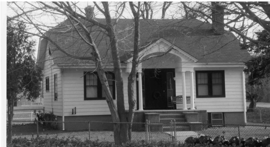
Sears Roebuck "The Rodessa" 1-story Bungalow clipped-hip gable and matching separate garage, Neo-classical inspired gable portico w segmented arch, double-columns and pediments, 1928