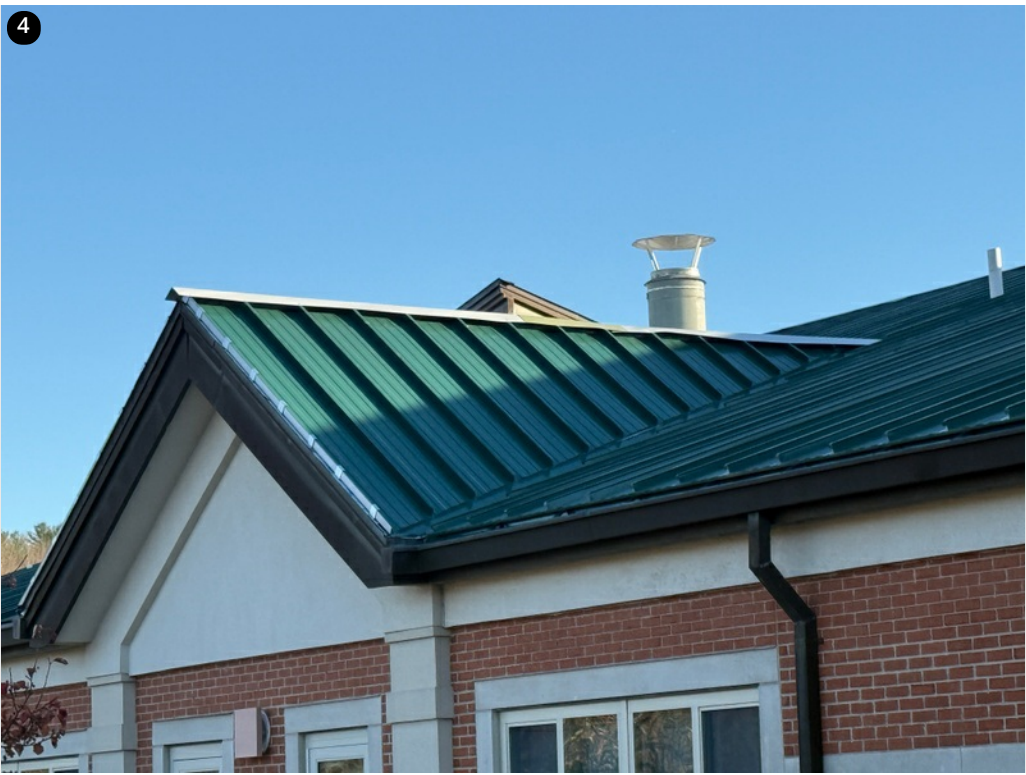
Temporary caps installed on all ridges in preparation for incoming rain- 11/20/24