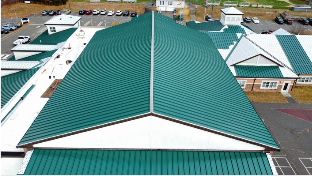
Temporary caps installed on ridge above the gym