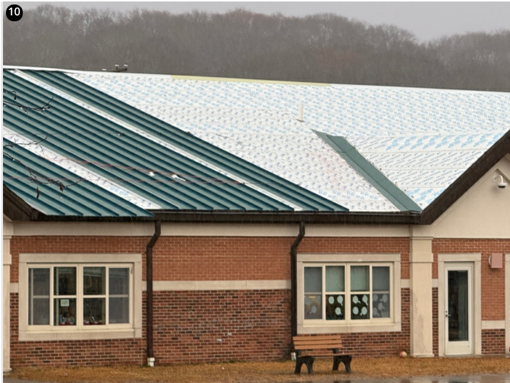
Small leak reported and addressed by Imperial near valley- 11/21/24