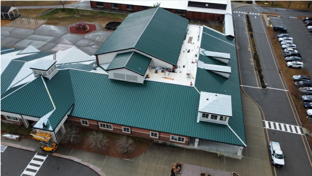
Temporary caps installed on all ridge locations- 11/20/24