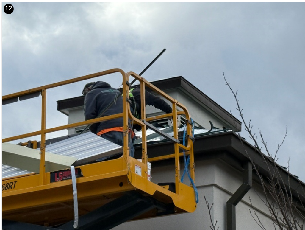
Crew fastening clips on dormer above side entrance- 11/22/24