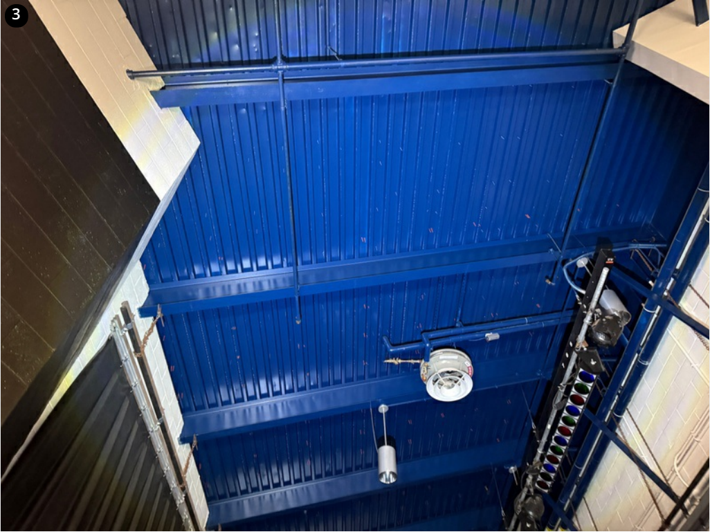
Fasteners observed properly penetrating deck- 11/18/24