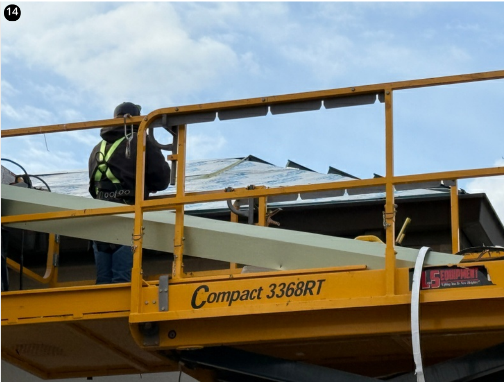
Crew taking measurements on dormer above side entrance- 11/22/24