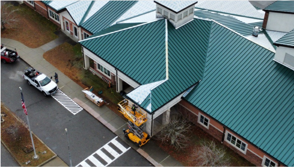
Crew installing panels on dormer above side entrance- 11/22/24