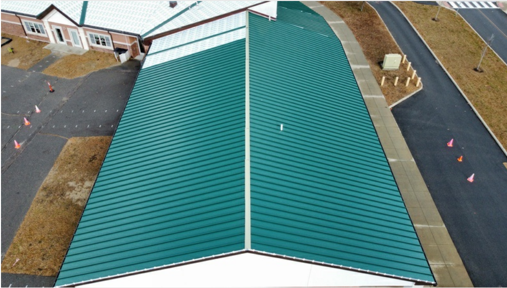
Temporary caps installed above kindergarten wing- 11/20/24