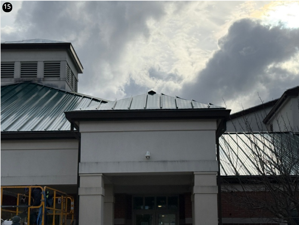
Panels installed on dormer above side entrance- 11/22/24