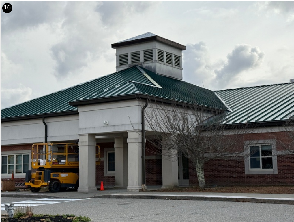
Dormer above side entrance- 11/22/24