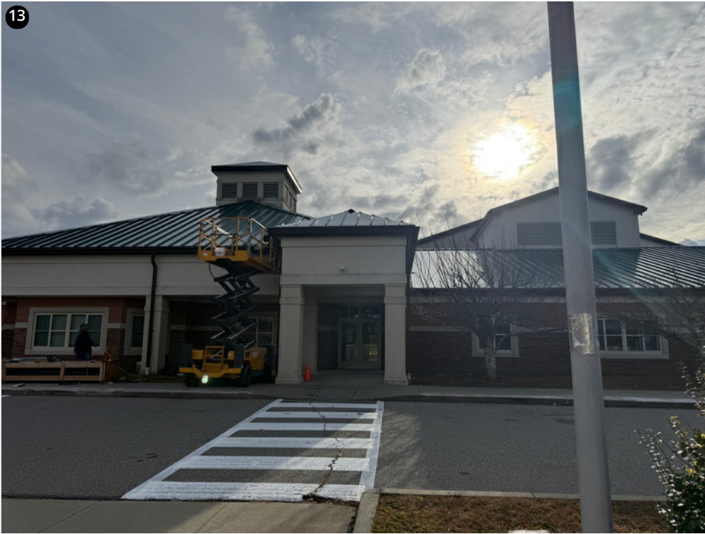
Panels installed on dormer above side entrance-11/22/24