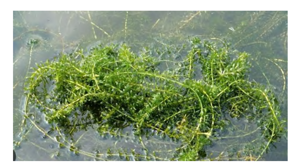
CT River Hydrilla

see the invasive plants in the water that they should bring the plant back to shore to let it defecate to help stop the spread of the plant. She noted the handout she provided at the February 14, 2024 Town Council meeting included a picture of the CT River Hydrilla .