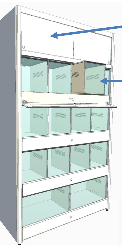
Lockable Upper Storage Compartment

Durable, lightweight, single piece aluminum removable enclosures