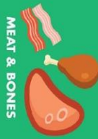
MEAT & BONES